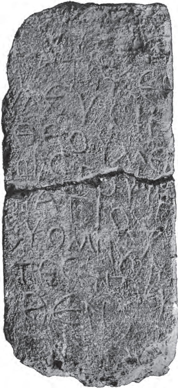
Plate X Greek inscription from Qasr Antar in the British Museum. After Clermont-Ganneau (1903b), pl.VIII.