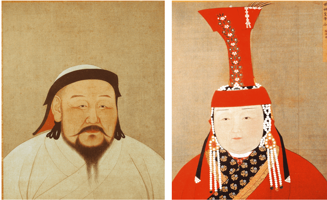
Fig. 3A. Portrait of Khubilai Khan, album leaf, ink and color on silk, 59.4x47 cm, China, Yüan dynasty, from Portraits of the Yüan Emperors (Yüan-tai Ti pan-shen-hsiang 元代帝半身像), Collection of the National Palace Museum, Taipei

Portraits of the past emperors and their consorts called yü-jung 御容 were kept in the Ying-t'ang. These portraits were of large dimensions: 245x210 cm (9.5x8 ft in Yüan measures). They were made from textile (usually k'e-szu 刻絲), an innovation that was highly valued but extremely costly and difficult to make. Khubilai's woven portrait, commissioned after his death by Temür in 1294, took more than three years to complete. 21 The chapter on paintings and sculpture in the Handbook of Governing (Ching-shih-ta-tien 經世大典) records several orders for portraits to be painted and converted to woven silk.