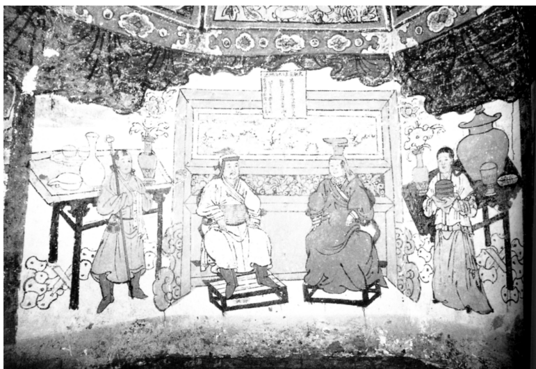
Fig. 14. Portrait of the tomb couple on the north wall, P'u-ch'eng tomb, Tung-erh 洞耳 village, P'u-ch'eng District, Shen-hsi province, 1269. From Liu Heng-wu 劉恒武, P'u-ch'eng Yüan-mu pi-hua so-i 蒲城元墓壁畫瑣議, K'ao-ku yü wen-wu 考古與文物 (2000-1), 67-70.

follow a Khitan/Liao 遼 and Jürchen/Chin 金 tradition of tomb decoration, itself modeled on a Chinese tradition. The man and his wife face inward in a three-quarters pose and sit on stools or on a folding chair. In the P'u-ch'eng-mu 蒲城墓 Tomb, the tomb mistress is a Sino-Mongol wearing the bogtag (Ku-ku-kuan 姑姑冠). The other women all appear Chinese by their garments, headdress and pose. These couples are probably partly sinicized Mongols, mixed-race couples, or Mongols who chose to be depicted in the Chinese fashion.