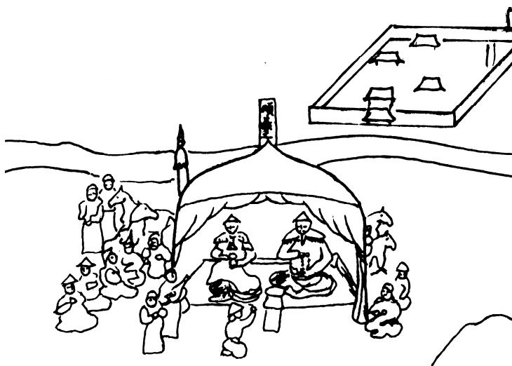
Fig. 16. Altan Khan and his wife in a yurt in front of Hohhot and the Ta-chao 大召 (Hung-tz'u-szu 弘慈寺), painting which accompanied a letter written on a horizontal scroll, dated August 17, 1580, addressed to the Ming emperor. Institute of Eastern Studies, attached to the Russian Academy of Sciences, St. Petersburg.

The reverse, seen in two tomb murals (San-yen-ching 三眼井, Ch'ih-feng 赤峰 Municipality, Inner Mongolia, and Pei-yü-k'ou 北峪口, Wen-shui 文水, Shan-hsi), seems to be an "anomaly," probably a Chinese influence. In a political document depicting Altan Khan and his wife (probably San-niang-tzu), the Khatun sits on the Khan's right (Fig. 16). 32 The switched position might have been intended to fit with Chinese customs, and to please the Ming emperor. Or the letter was rewritten and redrawn by the Ming officials before being presented to the emperors, as was usual for this kind of document. In other cases, the position of power of a woman such as San-niang-tzu, or her great age, can reverse the usual gender position. A related question is the fastening of garments on the right that served as a basic ethnic marker distinguishing Mongols from Chinese.