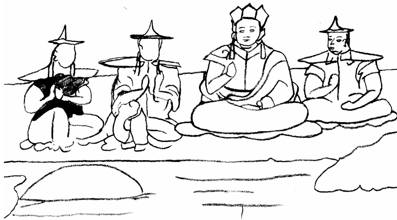
Fig. 8. Painting of donors, detail, south wall, lower register (120x50 cm), right to the entrance, Cave no. 28 at Arjai (Otog, Ordos). Drawing by I. Charleux

It is important to notice that this painting covers only a small part of the south wall (to the right of the entrance) of the cave, which is dedicated to tutelary deities ( yidam ) and to Tibetan masters. Its location indicates that Chinggis Khan was not the main object of worship: Chinggis Khan, if it is him, is represented as a Buddhist lay donor (although it could also be a Tantric priest because of his three-fold crown). The conical hats, costumes and general style and composition suggest a much later date (Northern Yüan or Ch'ing dynasty).