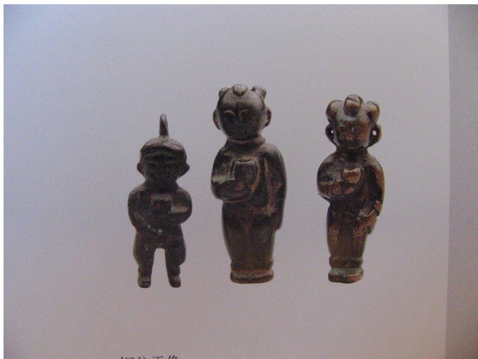
Fig. 2. Three ongon, bronze (5 cm, 4,8 cm and 4.3 cm), Mongol Empire, excavated in T'ung-liao 通遼 Municipality, Inner Mongolia. From: Ta-han Te Shih-chieh: Meng-yüan Shih-tai Te To-yüan Wen-hua Yü I-shu 大汗的世界：蒙元時代的多元文化與藝術, eds. Shih Shou-ch'ien 石守謙 and Ko Wan-chang 葛婉章 (Taipei: National Palace Museum, 2001)

could dwell in an ongon were either angry and potentially dangerous human spirits, or great ancestors. The Mongols used to feed their ongon by smearing their mouth and sometimes the whole face with fat and cooked meat, by sprinkling and fumigation. In exchange, the spirit would protect the household or clan, bestow prosperity, and ensure success in hunting. The most important feature in the definition of an ongon is the food: the spirit remains within as long as it is fed. Therefore the stone statues can also be included in the category of ongon .