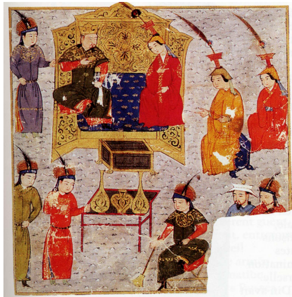
Fig. 12 (left). Enthronement scene depicting the ruler and his consort surrounded by members of the court, detail, Jami 'al-tavarikh (Compendium of Chronicles) by Rashīd ad-Dīn, illustration from the Diez Albums, ink, colors and gold on paper, Iran (possibly Tabriz), early 14th century, Staatsbibliothek zu Berlin – Preussischer Kulturbesitz, Orientabteilung (Diez A fol. 70, S. 10)