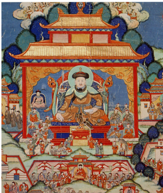
Fig. 9. Abatai Khan, central part of a cloth thangka , unknown painter, 62x86 cm, Central Museum, Ulan-Bator

Abatai Khan is represented at the centre of a thangka in an imaginary palace surrounded by miniature scenes from his life (Fig. 9). 31 Below him stands his monastery, Erdene Juu. The central figure and his attendants are in fact copied from the one of the above mentioned paintings of Abatai Khan at Erdene Juu. But here, Abatai has a vajra -topped hat and holds lotuses that carry a sword and a vajra : the king is depicted with the attributes of a bodhisattva. His position, palace and courtiers mirror that of the king of Shambhala in 19th-century thangkas .