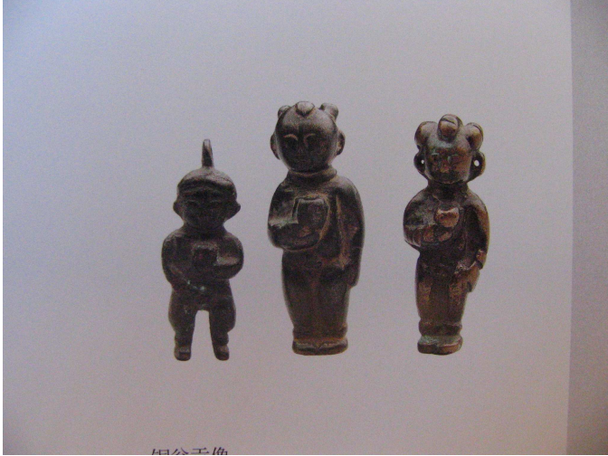
Fig. 2. Three ongon , bronze (5 cm, 4,8 cm and 4.3 cm), Mongol Empire, excavated in T'ung-liao 通遼 Municipality, Inner Mongolia. From: Ta-han Te Shih-chieh: Meng-yüan Shih-tai Te To-yüan Wen-hua Yü I-shu 大汗的世界：蒙元時代的多元文化與藝術, eds. Shih Shou-ch'ien 石守謙 and Ko Wan-chang 葛婉章 (Taipei: National Palace Museum, 2001)

could dwell in an ongon were either angry and potentially dangerous human spirits, or great ancestors. The Mongols used to feed their ongon by smearing their mouth and sometimes the whole face with fat and cooked meat, by sprinkling and fumigation. In exchange, the spirit would protect the household or clan, bestow prosperity, and ensure success in hunting. The most important feature in the definition of an ongon is the food: the spirit remains within as long as it is fed. Therefore the stone statues can also be included in the category of ongon .