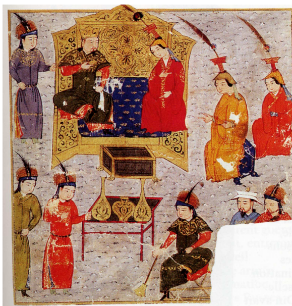
Fig. 12 (left). Enthronement scene depicting the ruler and his consort surrounded by members of the court, detail, Jami 'al-tavarikh (Compendium of Chronicles) by Rashīd ad-Dīn, illustration from the Diez Albums , ink, colors and gold on paper, Iran (possibly Tabriz), early 14th century, Staatsbibliothek zu Berlin – Preussischer Kulturbesitz, Orientabteilung (Diez A fol. 70, S. 10)