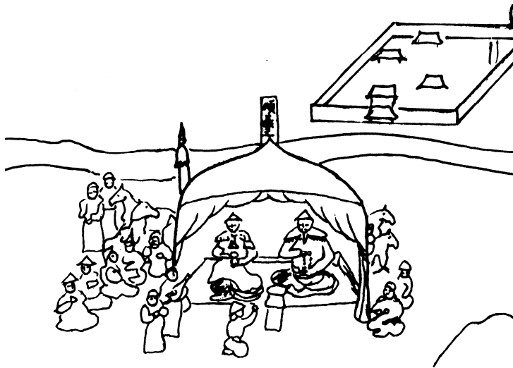
Fig. 16. Altan Khan and his wife in a yurt in front of Hohhot and the Ta-chao 大召 (Hung-tz'u-szu 弘慈寺), painting which accompanied a letter written on a horizontal scroll, dated August 17, 1580, addressed to the Ming emperor. Institute of Eastern Studies, attached to the Russian Academy of Sciences, St. Petersburg.

The reverse, seen in two tomb murals (San-yen-ching 三眼井, Ch'ih-feng 赤峰 Municipality, Inner Mongolia, and Pei-yü-k'ou 北峪口, Wen-shui 文水, Shan-hsi), seems to be an "anomaly," probably a Chinese influence. In a political document depicting Altan Khan and his wife (probably San-niang-tzu), the Khatun sits on the Khan's right (Fig. 16). 32 The switched position might have been intended to fit with Chinese customs, and to please the Ming emperor. Or the letter was rewritten and redrawn by the Ming officials before being presented to the emperors, as was usual for this kind of document. In other cases, the position of power of a woman such as San-niang-tzu, or her great age, can reverse the usual gender position. A related question is the fastening of garments on the right that served as a basic ethnic marker distinguishing Mongols from Chinese.