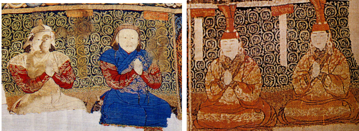
Fig. 4A and 4B. Mandala of Vajrabhairava, k'e-szu, 246.1x208.3 cm, China, ca. 1328-29 or after 1332, The Metropolitan Museum of Art of New York (Purchase, Lila Acheson Wallace Gift, 1992 (1992.54). Detail: two emperors, Tug Temür and Khoshila, on the lower left of the thangka and their respective consorts Budashiri and Babusha on the lower right.

It is not known if the emperor's portraits were consecrated or not, but their location in the temple show that they were considered as something between Buddhist icons and Chinese ancestor paintings. The enlarged portraits were produced in triplicate and distributed to Buddhist monasteries across China as formal public displays of the sovereign's image. There was therefore a multiplication of two-dimensional images of deceased emperors, sculpture being apparently excluded.