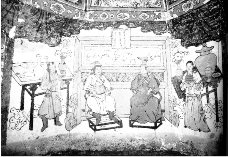
Fig. 14. Portrait of the tomb couple on the north wall, P'u-ch'eng tomb, Tung-erh 洞耳 village, P'u-ch'eng District, Shen-hsi province, 1269. From Liu Heng-wu 劉恒武, P'u-ch'eng Yüan-mu pi-hua so-i 蒲城元墓壁畫瑣議, K'ao-ku yü wen-wu 考古與文物 (2000-1), 67-70.

follow a Khitan/Liao 遼 and Jürchen/Chin 金 tradition of tomb decoration, itself modeled on a Chinese tradition. The man and his wife face inward in a three-quarters pose and sit on stools or on a folding chair. In the P'u-ch'eng-mu 蒲城墓 Tomb, the tomb mistress is a Sino-Mongol wearing the bogtag (Ku-ku-kuan 姑姑冠). The other women all appear Chinese by their garments, headdress and pose. These couples are probably partly sinicized Mongols, mixed-race couples, or Mongols who chose to be depicted in the Chinese fashion.