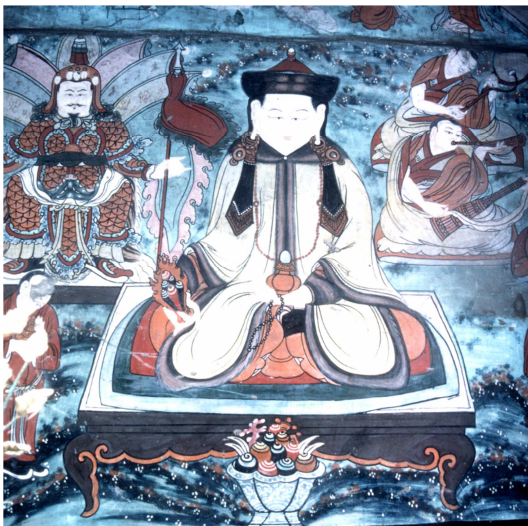
Fig. 6. San-niang-tzu, detail of the right part of the Maidariin Juu donors' painting.