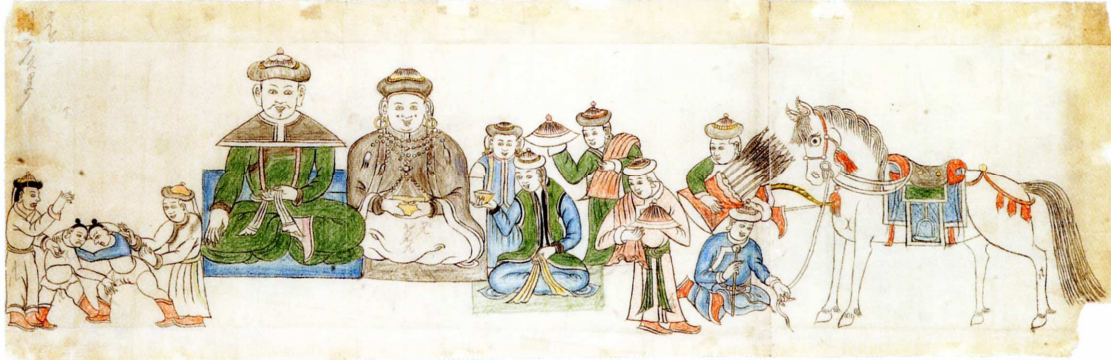
Fig. 7. One of the three paintings representing Abatai Khan, copy by Dendev of a mural painting (not preserved) of Erdene Juu, H: 150 cm, L: 100 cm. Zanabazar Museum of Fine Arts, Ulan-Bator. From Tsultem, 1986, 150.

The second example is a series of three paintings of Abatai Khan (1554–1588), the Tüüshet Khan of Khalkha Mongolia, painted on a wall at Erdene Juu monastery (in present-day Mongolia). They are known from copies made by Dendev in 1950 (Fig. 7): the originals have not been preserved. 29 The Khan is depicted sitting cross-legged alone, or with his wife, and receiving the homage of monks and laymen. Abatai Khan, the founder of the monastery (1585–1586?), was buried there: Erdene Juu, like Maidar Temple, became a funerary shrine after the death of its founder. His large tent preserving his throne, weapons, and statues was worshipped there (and later transferred to Khüree).