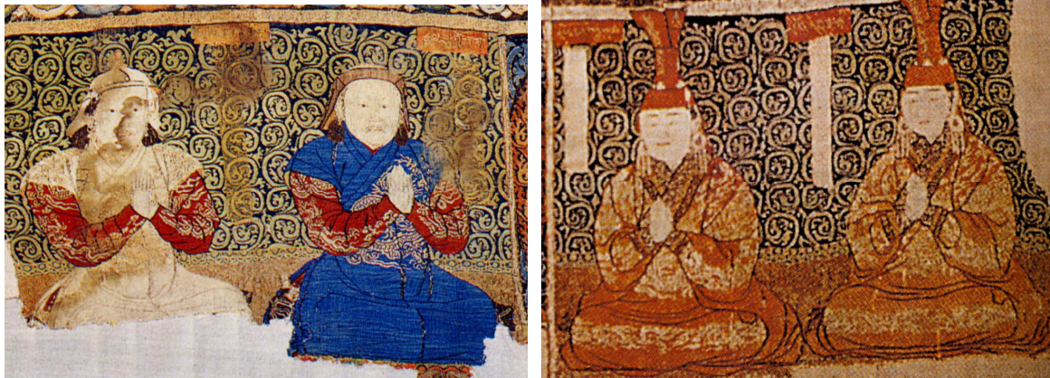
Fig. 4A and 4B. Mandala of Vajrabhairava, k'e-szu, 246.1x208.3 cm, China, ca. 1328-29 or after 1332, The Metropolitan Museum of Art of New York (Purchase, Lila Acheson Wallace Gift, 1992 (1992.54). Detail: two emperors, Tug Temür and Khoshila, on the lower left of the thangka and their respective consorts Budashiri and Babusha on the lower right.

It is not known if the emperor's portraits were consecrated or not, but their location in the temple show that they were considered as something between Buddhist icons and Chinese ancestor paintings. The enlarged portraits were produced in triplicate and distributed to Buddhist monasteries across China as formal public displays of the sovereign's image. There was therefore a multiplication of two-dimensional images of deceased emperors, sculpture being apparently excluded.