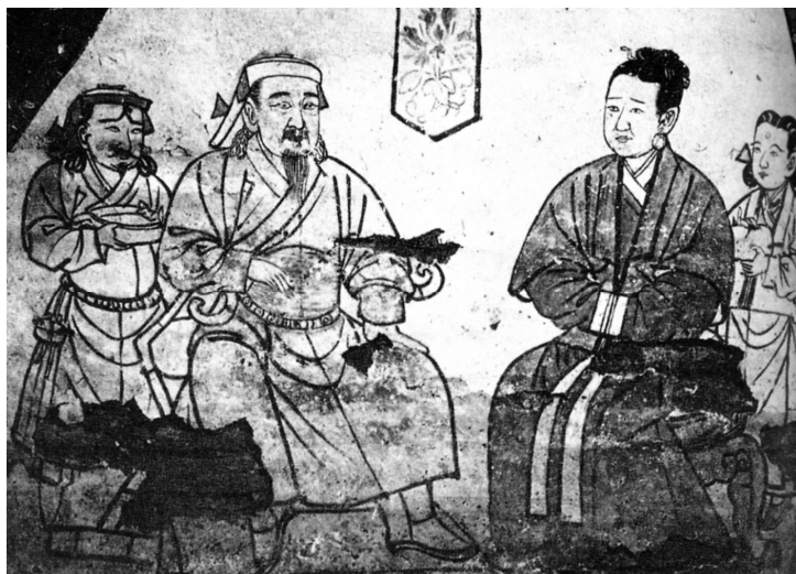
Fig. 15. Painting of the tomb occupants, detail, Yüan-pao-shan 元寶山 Tomb, north wall (L: 2.43 m; H: 0.94 m), Ch'ih-feng Municipality. From Hsiang Ch'un-sung 項春松, Nei Meng-ku Chifeng shih Yüan-pao-shan Yüan-tai pi-hua mu 內蒙古赤峰市元寶山元代壁畫墓, Wen-wu 文物 1983-4, 40-46.