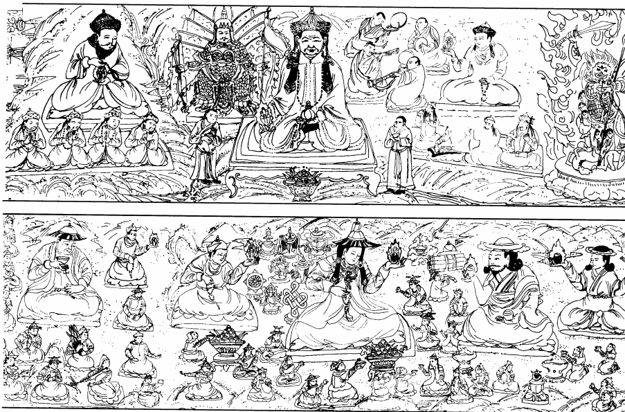
Fig. 5. Mural painting representing Buddhist lay donors and monks of Altan Khan's family, main temple of Maidariin Juu, H: 2 m, L: 16 m, 17th century.