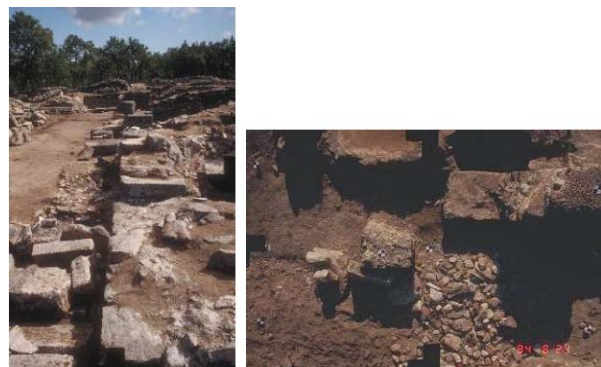
Figure 2. Excavation field of a roman forum in Sarmizegetusa (Romania).

After these localization work, it is required to record the events that occurred during the excavation and to survey the discovered elements. A journal is then written to keep exactly the progresses of the labours, and the objects are traditionally recorded by the following procedures: -archaeological photography, on which a scale (staff or measuring rod put in the principal object's plan) must always appear; -latex or plaster cast, and paper or latex stamping to take impressions of engravings or inscriptions; -handmade measurements and sketches; -field samplings.