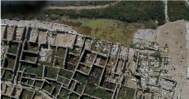
Figure 1. An vertical photo showing Delos vestiges (with a squaring for future adjustments).

More generally, as a specialist in photogrammetry, the surveyor contributes to apply imaging techniques to archaeology (Table 2).