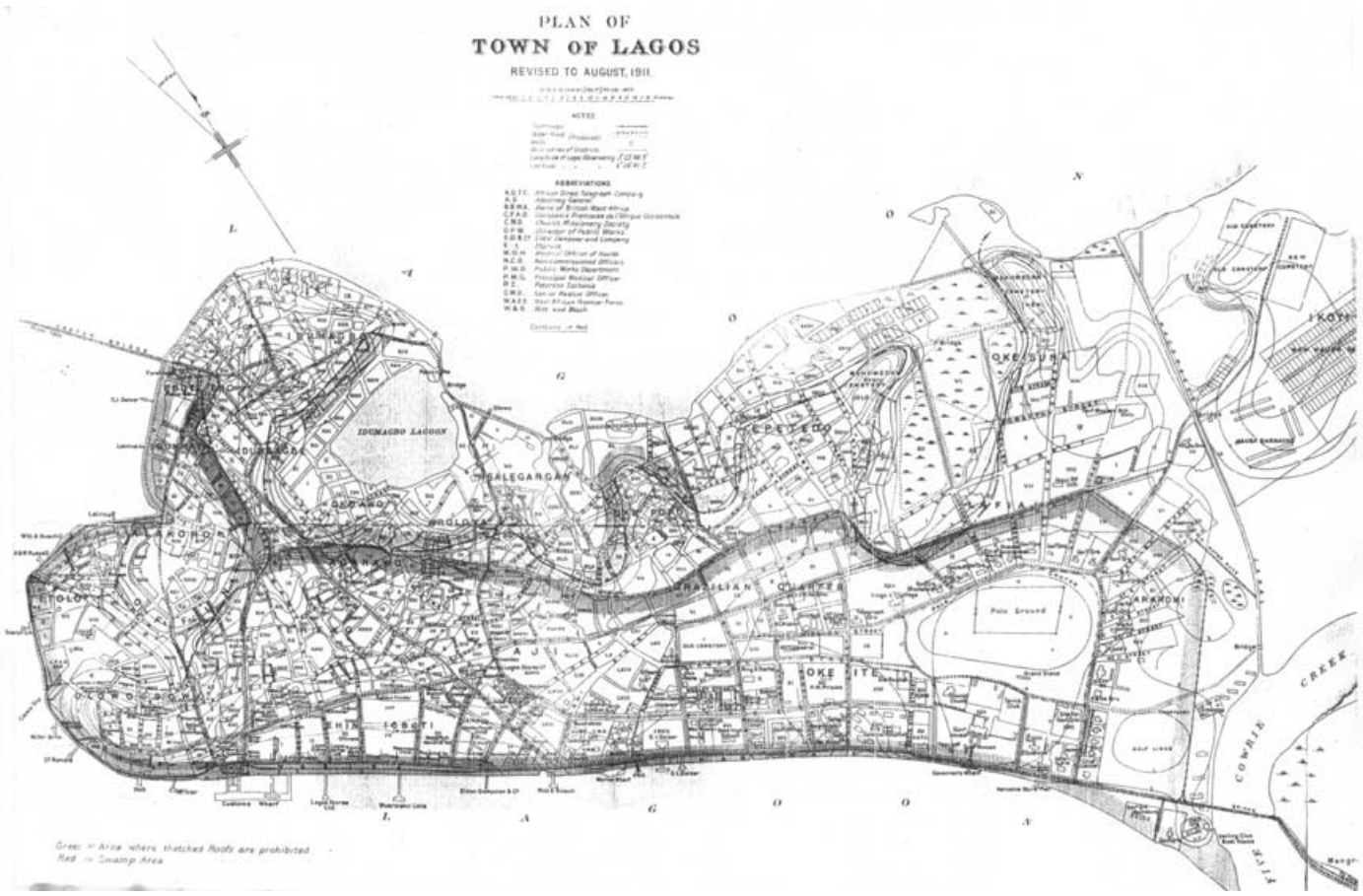
Map 1. Lagos Island in 1911.