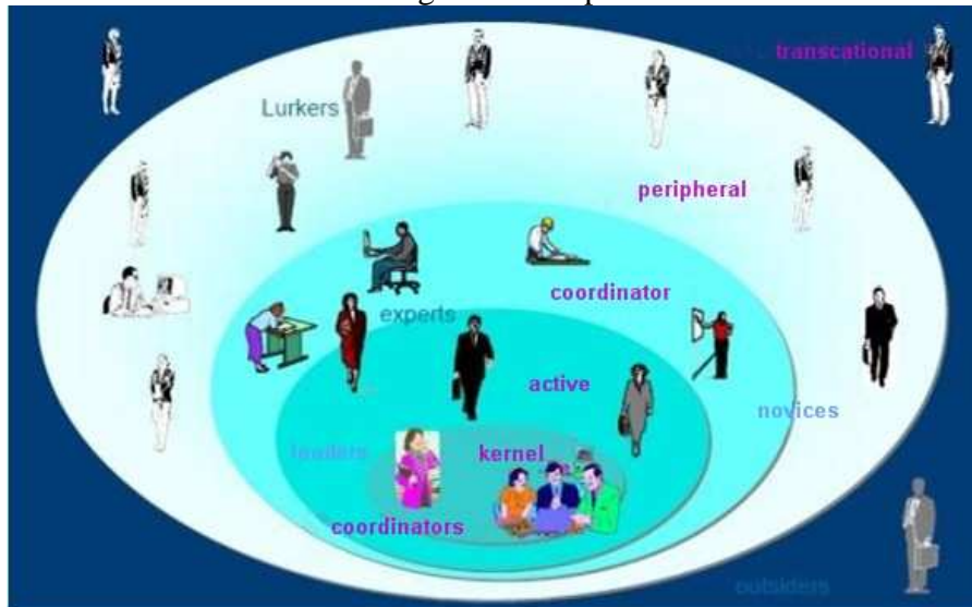
Figure 2: Levels of participation ([Soulier, 2004] adapted from [Wenger, 01])

There are different types of actors in a CoP (coordinator/facilitator, expert, sponsor, leader, administrators, passive members, lurker...) which can be classed according to their implication levels.