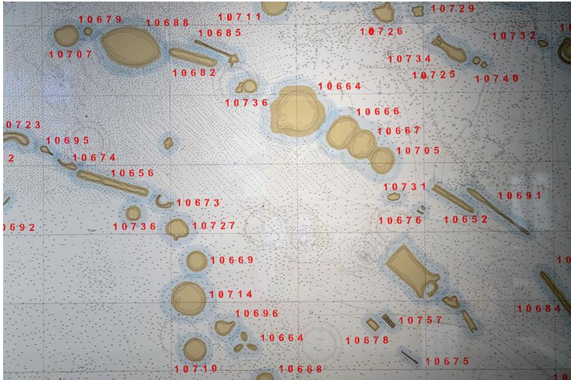
Detail of A Topography of Loss. Invisible Inventories exhibition, Rautenstrauch-Joest Museum, Cologne (28 May-19 August 2021).

There are clear parallels between this nautical chart and the database of the <u>International</u> <u>Inventories Programme</u>; both are intentions to develop a form of archive, and have a speculative dimension. But where the database seeks to catalogue all Kenyan objects which are currently not in Kenya, the nautical chart offers a glimpse into a utopian future. Maybe one day, we will find only traces and emptiness as all the objects will have returned to their countries of origin.