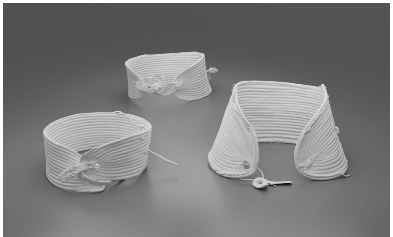
3D printed replicas of the Kikonde Bracelets, Rautenstrauch-Joest Museum, Cologne.

The work A Topography of Loss (2021) is a further inquiry into the agency of objects which we started to explore in our book project <u>Letter to Lagat</u> (Strzelecki Books, 2015). The book explores the site of an empty ethnographic and African art collection, and examines the question of what would be left when all the objects return home. We took a forensic approach to the museum and by envisaging it as a kind of crime scene we highlighted the power and agency of these objects and the multiple traces they left behind.<sup>1</sup>