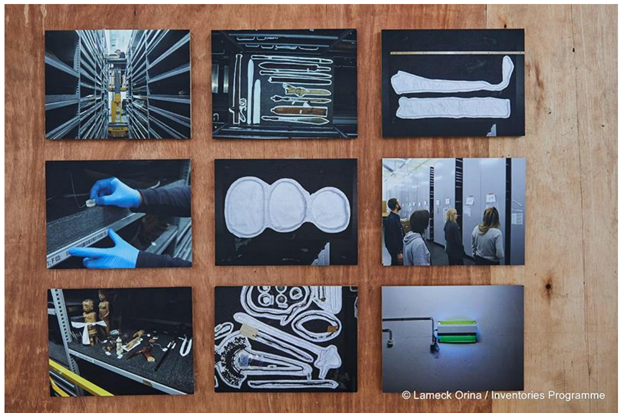
Documentation of the storage facilities in the Rautenstrauch-Joest Museum, Cologne. Invisible Inventories exhibition, National Museum of Kenya, Nairobi (18 March-2 May 2021). Installation photo: Lameck Orina, 2021.

To us, these negative spaces appeared to describe the loss of the objects from their communities of origin, both literally but also metaphorically. The immense number of depressions, each of which had been individually tailored to a particular object, seemed to speak of a museum approach which was both almost industrial in scale, yet was individually applied to unique artifacts. These negative spaces were not only bespoke prison cells, they also seemed to us like footprints that the objects had left behind.