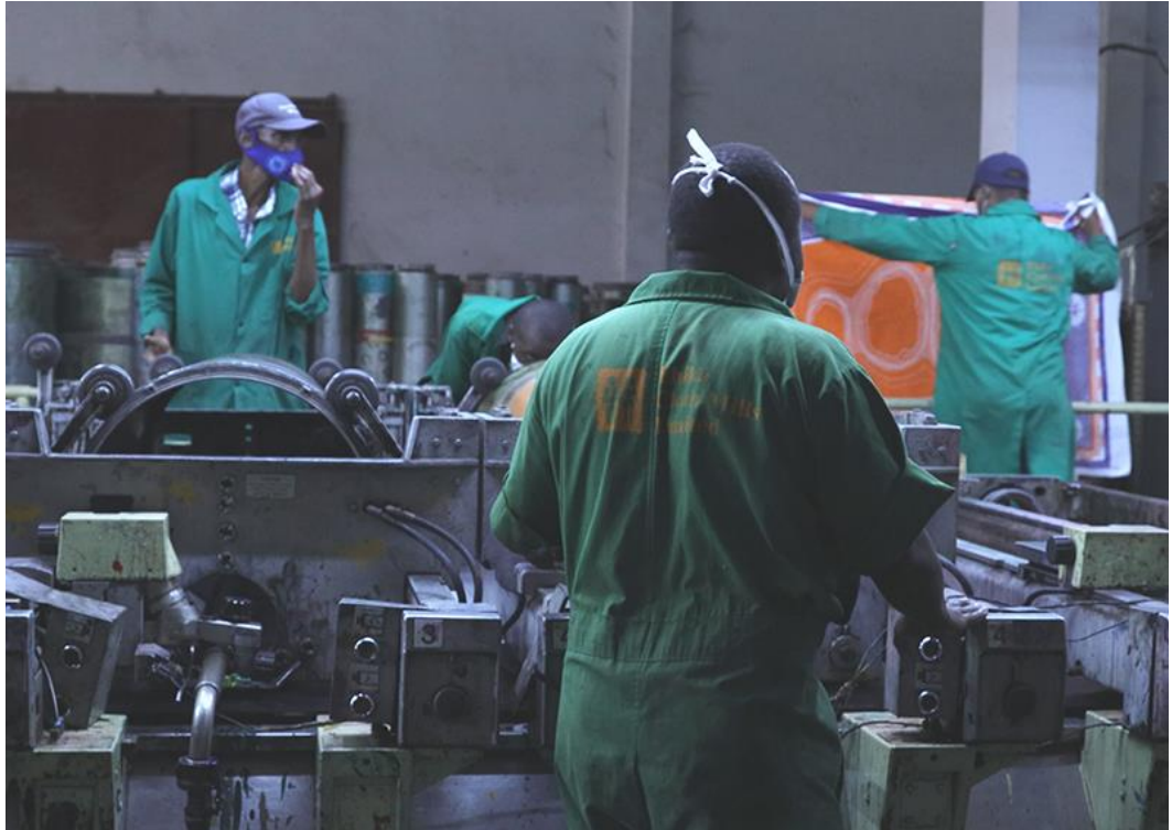
Silkscreening of the kanga « Anadaiwa hata kope si zake », Thika Cloth Mills. Photo: Hopkins/Rittmeier, 2021.

We wanted to develop an iteration of the A Topography of Loss series which could be distributed beyond museum-going audiences. A kanga seemed like an ideal form for this. It is a popular, indeed iconic Kenyan and East African garment which is printed with a central motif, a border design and a saying. Hence it is an article of clothing that you wear, and a medium with which you communicate (to your family, friend, neighbours, allies, rivals etc).