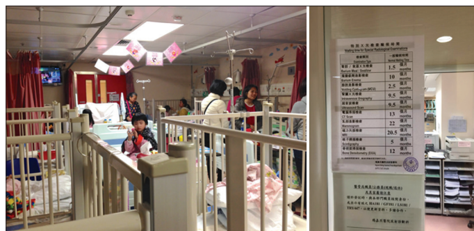
Figure 2. A room in the children's department and the waiting list displayed in Queen Mary hospital, Hong Kong.

Today, a growing number of Tier 1 and AAA hospitals admit patients only after online pre-registration. It is done with a mobile phone app. Features included in apps such as WeChat include advanced functionalities, such as sharing blood test results or other diagnoses between medical staff and patients. According to many doctors, this system of registration has already changed the