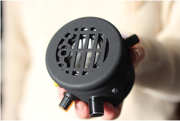
Figure 3. The FAUST Gramophone.

3.6, but it is much less powerful than the Teensy 4.0 (which runs at 600MHz).