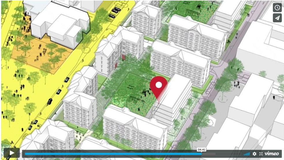
Fig. 4. Visualization and final Esquis'Sons! sound sketch for the Abbaye District, Grenoble – (Architectural Axonometry with the kind permission of Particules Office) France, video [19]

specific sound atmospheres that might be created in the center. It is also the place for plenty of potential sonic interactions between the facades' users and the public spaces. It was also decided to reinforce several uses in the public spaces (as playgrounds for children, a public gardening space, increasing the size and the number of markets during the week, open the ground floor of the buildings to rent for local shops and for craftsmen or young companies). Finally, it also gave goals for the "acoustic" qualities of the facade of the new building. All these scenarios have been input in the application and the result can be listened by following the link below.