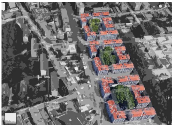
Fig. 3. 3D Satellite view (Google map/IGN) of Abbaye District, Grenoble, France, 2019.

To illustrate this part, recently, Esquis’Sons has also been used in a feasibility and programmatic study of the neighborhood L’Abbaye in Grenoble (France). The Parisian architectural office Particules [17] used an Esquis’Sons! sound sketch to support their scenario for the rehabilitation of the existing buildings. The district of L’Abbaye is a working-class residential area built after the Second World War and currently suffering from a lack of renovation. The majority of apartments, managed by a social housing landlord, are empty because they do not comply with the rules of contemporary construction. The social housing landlord, along with the City Hall had obtained to classify these buildings as elements of the industrial heritage of the 20 th century.