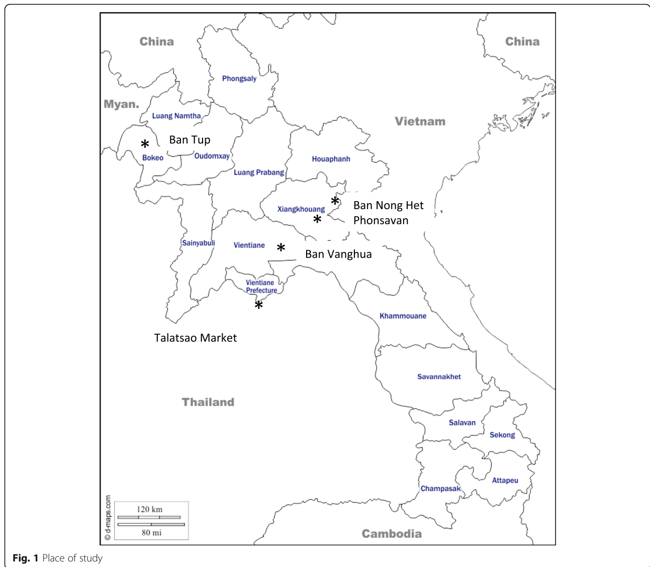
Fig. 1 Place of study

from Vientiane city close to Phu Khao Khuay national park. Specimens were collected at an elevation ranging from 450 to 1000 m in young and older secondary mixed deciduous forests, along creeks banks, in rice field areas, along pathways or in a healer's garden.