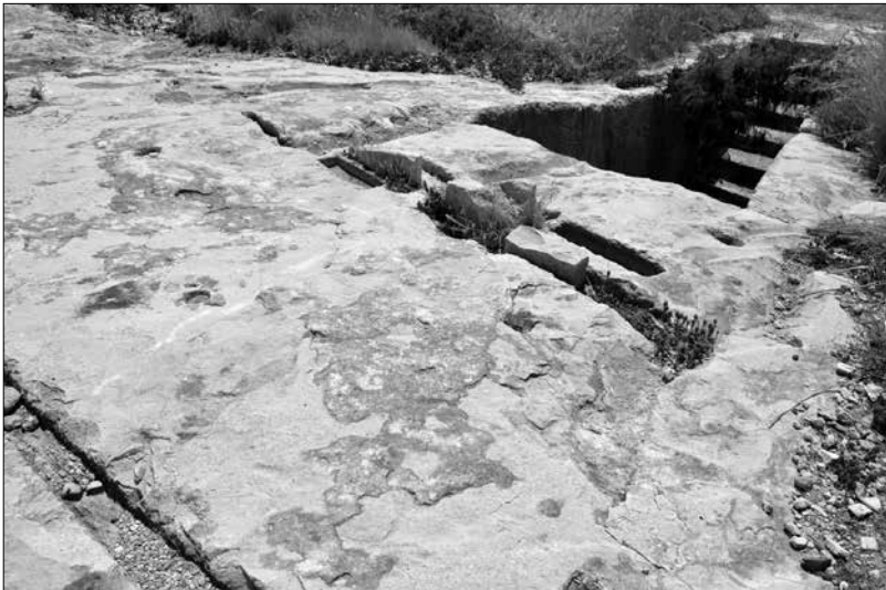
Figure 3. Eastern necropolis, cavities on the rock for the installation of steles and other ritual facilities (April 2014)

Can we suppose the existence of burial markers of different kinds? Some elements suggest it, for example a Corinthian capital discovered by the Swedish mission in Tomb 2 (Gjerstad et al. 1935: 9), or the column known as the ‘Agucchia’ (or ‘Aiguille’, needle, in Stefano di Lusignano 1573, quoted by Hellmann 1984: 79–80, no. 137), mentioned by several travellers of the 18th and beginning of the 19th centuries and possibly located within the northern necropolis (Hellmann 1984: 79–80, no. 137, 81, no. 142, 82–83, no. 149, 84, no. 152 [and perhaps fig. 30]). These isolated columns, only some elements of which have survived, were possibly funerary monuments of Alexandrian inspiration, characterising the Amathusian funerary landscape in the Hellenistic and Roman periods (Cannavò in press). Among other isolated burial markers, the Swedish mission excavated a unique example of a funerary tumulus , covering an incineration in an alabaster urn, certainly the burial of an Alexandrian official (Tomb 26: Gjerstad et al. 1935: 136–138; Parks 2009: 237).