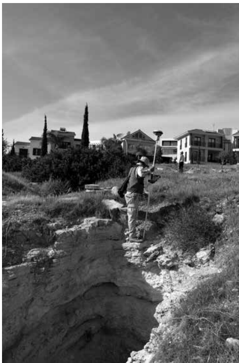
Figure 2. Lionel Fadin geo-referencing Tomb 587, in the Eastern necropolis (April 2014)

now number 1,258. It is evident, then, that what is available to the general public is only a small part of the archaeological data collected during such a large number of discoveries. The aim of the GIS is not to publish all these tombs, but to collect the information concerning their location and chronology, in order to integrate them into the general cartography of the town. Thanks to the collaboration of the Department of Antiquities, it was possible in 2015 to study a considerable number of the archival documents kept at the Cyprus Museum in Nicosia.