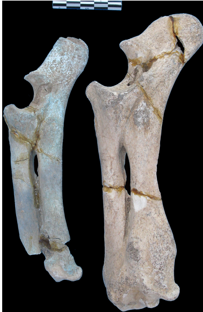
Fig 1. Lateral views of unburnt (right) and calcined (left) radio-ulna of adult dwarf hippos from Akrotiri-Aetokremnos. Both specimens belong to the species Phanourios minor (Desmarest, 1822) [Boekschoten and Sondaar, 1972] and come from stratum 4, Feature 3, FN684. The right specimen is unburnt while the left specimen is calcined and shows the blue-green color. Note the smaller size of the calcined specimen (15% and 20–27% smaller for length and width, respectively) compared to the unburnt one. This difference in size mostly likely results from bone retraction due to calcination.