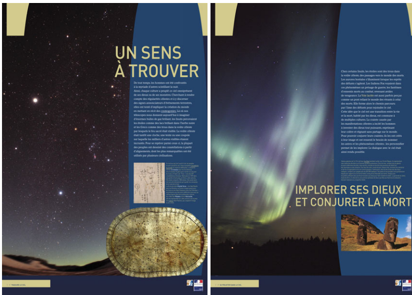
Figure 1. Two examples of CMC posters: Need for a meaning from the introductory part and Pray the gods and conjure death from the part on personal uses.

with heavens. To match better the interest of the audience, the authors organized the exhibition differently from usual books or exhibitions: instead following different civilisations or ethno-geographic areas, CMC categorised the information according to invariant worldwide uses of the heavens, along two main lines: collective uses such a predict and dominate and individual uses as guess what future will be .