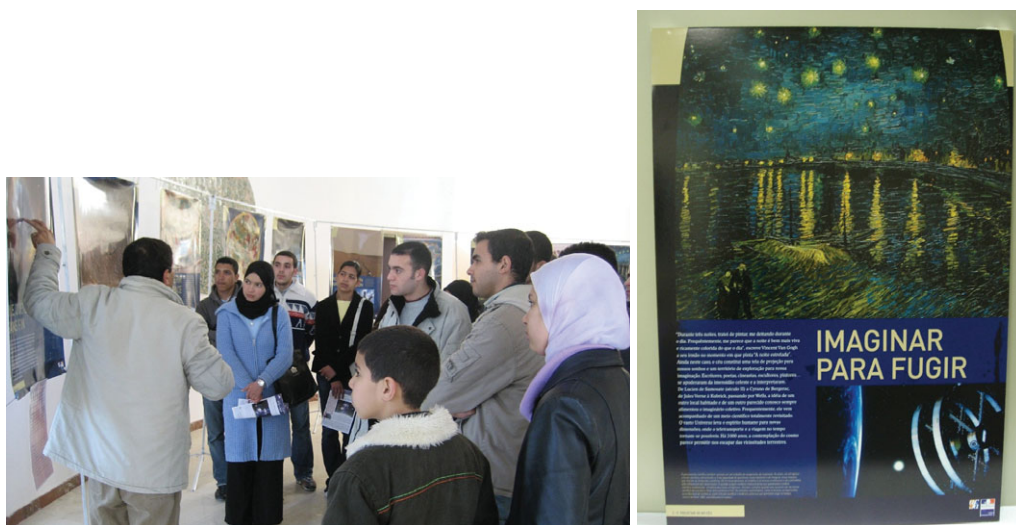
Figure 4. (Left): Presentation by IFO and FCO at the Université des Sciences de Oudja (Morocco). (Right): Translated copy of CMC touring in the framework of Brazil-France year.

During this operation, scientists or specialists in the history of astronomy also delivered 13 lectures and three 1- or 2-day training sessions were set up for activity organisers and leaders. A wide variety of workshops was offered in each location: Two or three days of scientific workshops, such as sky maps or sundials and sometimes water-rockets workshops; Art workshops such as science-fiction model building making use of daily life