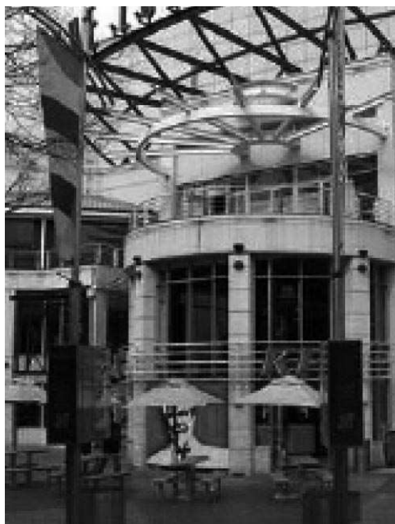
► Photo 3: Street life in Rosebank Management District, Johannesburg.