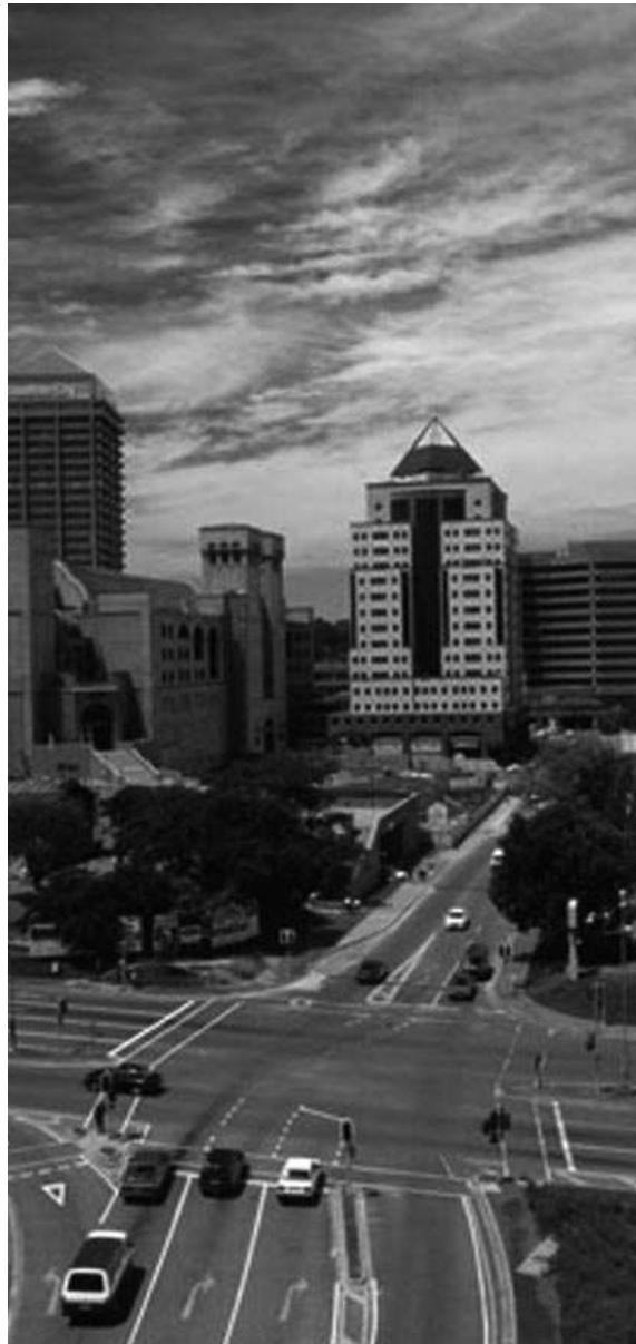
► Photo 5: Overview of the Illovo Boulevard Management District.