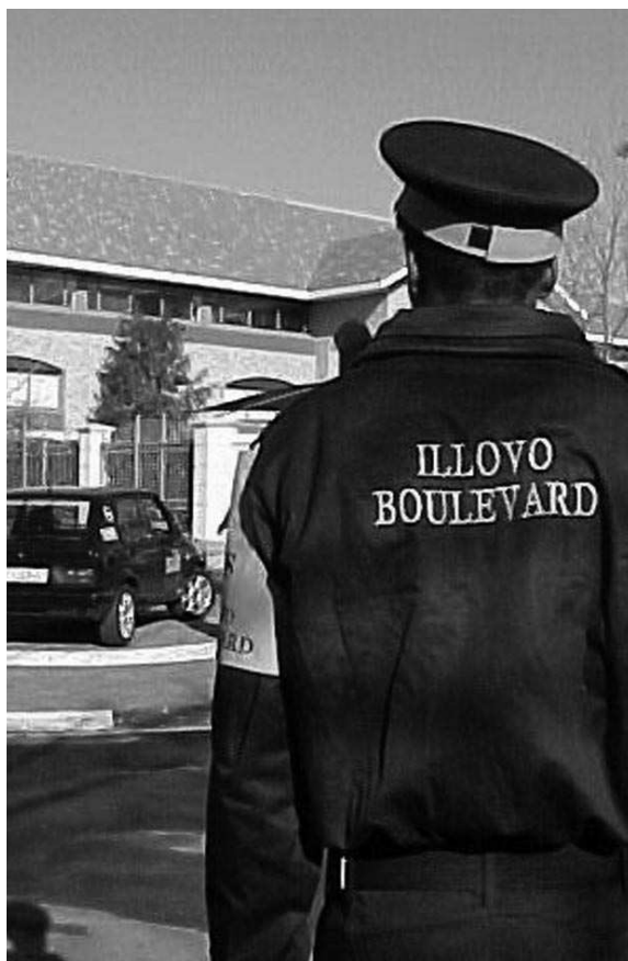
► Photo 7: A private security guard employed by the Illovo Boulevard Management District.

tions, 42 in particular through promoting corporate interests to the detriment of addressing social issues. The form of local democracy that is fostered by BIDs is also put into question, 43 in particular the trends towards an elite-driven urban redevelopment.