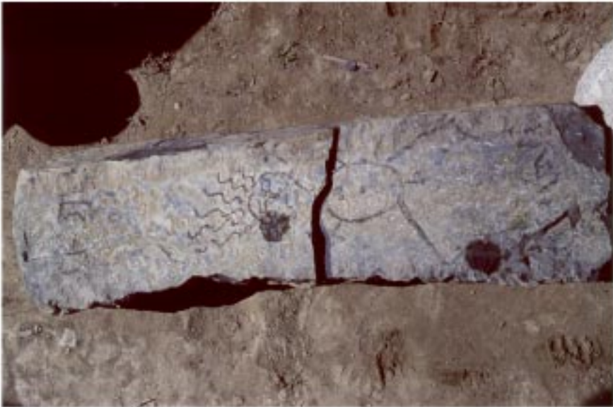
Fig.4 The broken stone.