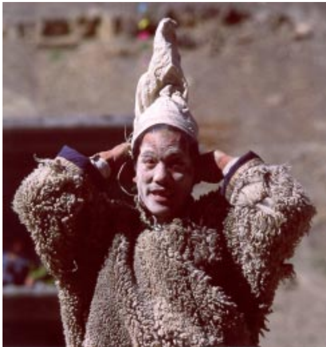
Fig.2 The Shepherd or Hunter. Gungri, Spiti, 2000.