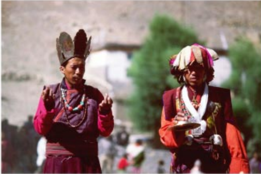
Fig.1 The lochen ringing cymbals and the «Goddess» (Iha mo) wearing a five lobed-crown, Gungri, Spiti, 2000.