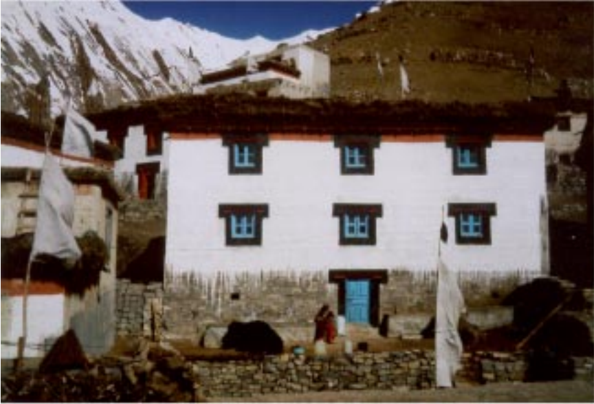
Fig.6. The house of buchen Dorje Puntsog. Mud, Spiti, 2001.