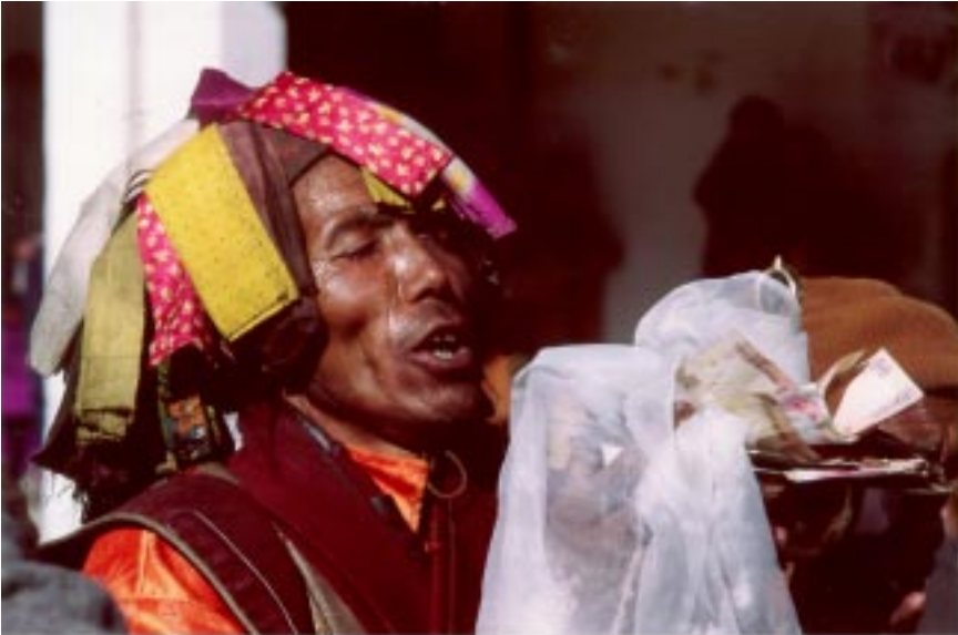
Fig.3 The lochen chanting the «explanation of the stone» (rdo shad), Gungri, Spiti, 2000.