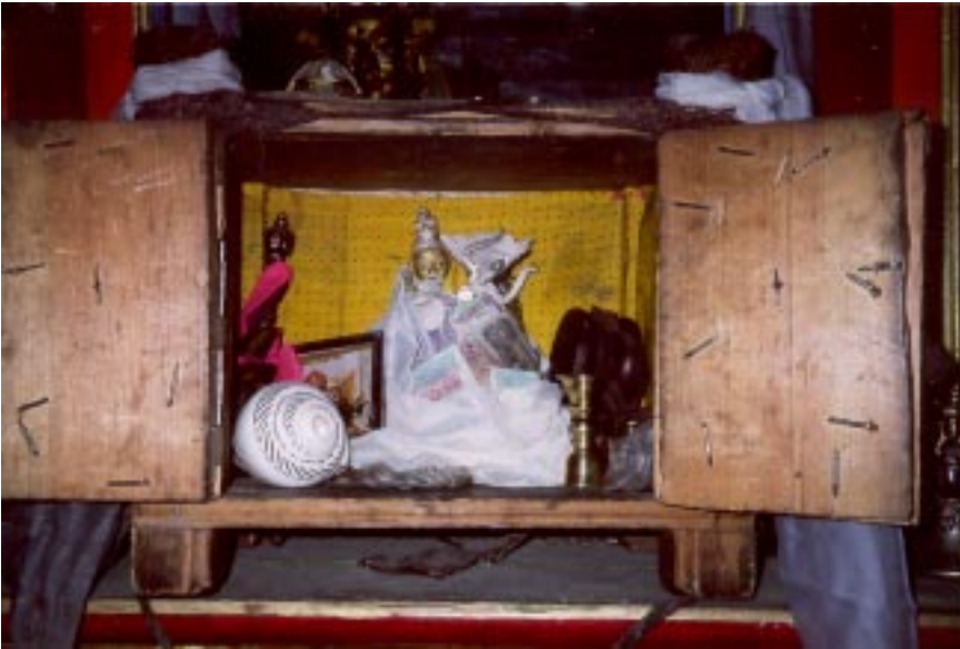
Fig.7. Thang stong rgyal po's box (thang rgam). Par, Spiti, 2001.