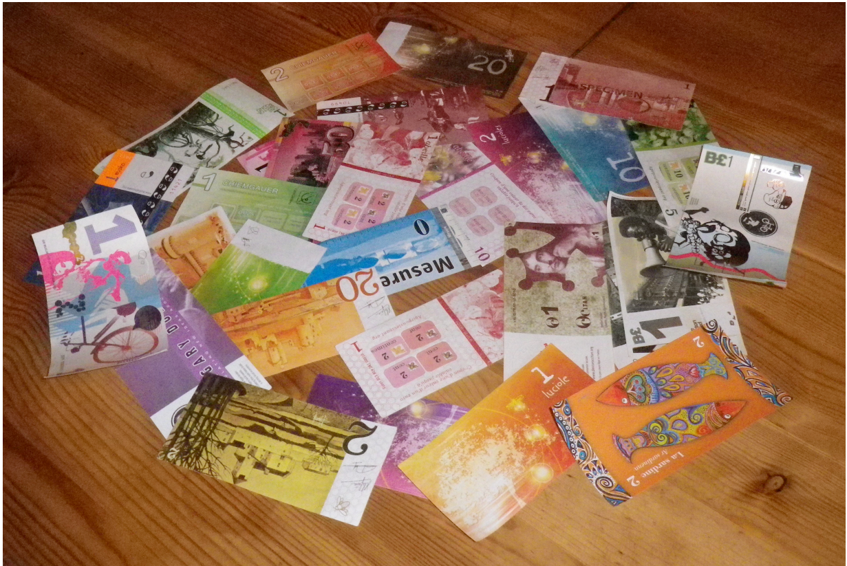
Figure 3. Examples of vouchers of brazilian CCS