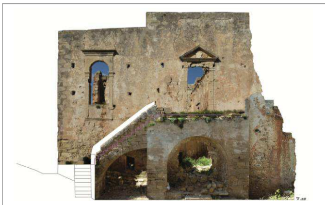
Fig. 6. The eastern front after digital image rectification with PhoToPlan .

We did not measure all the wall panels because of serious dangers of collapse and access difficulties. In particular, the perimeter walls lost their vertical arrangement and vertical cracks clearly show they are “opening up”: we measured the whole crack pattern through image rectification (Fig. 6).