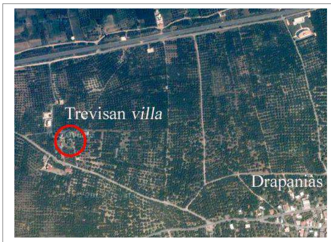
Fig. 1. Aerial photograph with indication of Drapaniàs and Trevisan villa .

The Trevisan villa is in the locality of Travasianà 14 , a few distance from the small village of Drapaniàs, east of Kissamos (Fig. 1). Unfortunately, Venetian written sources about Chania region (from which Kissamos area depended) were lost, and the only source to learn the architectural typology and the building techniques is the building itself.