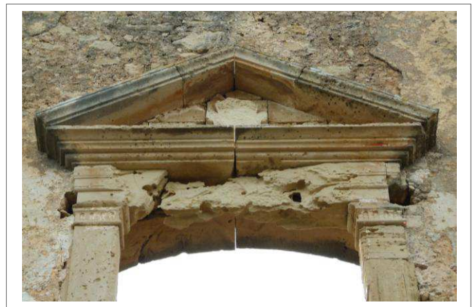
Fig. 4. The tympanum of the main door at the first floor in a photograph of 2013.

The building has got a ground floor, eventually used as a warehouse, and a residence at the upper floor ( piano nobile ): both of them are organized according to three spans ( ab , cd and ef ). At the ground floor (Fig. 5), spatial distribution of the