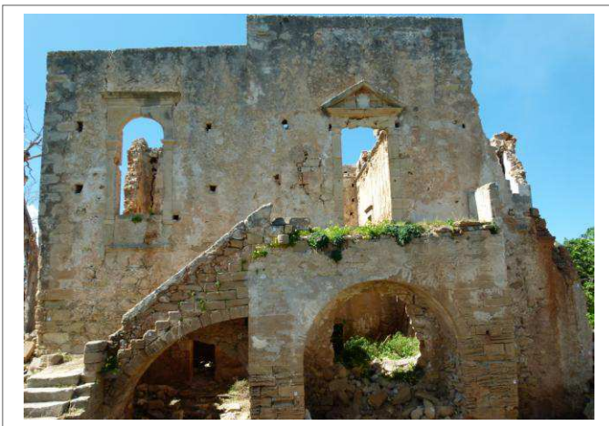
Fig. 3. The eastern façade in a photograph of 2013.