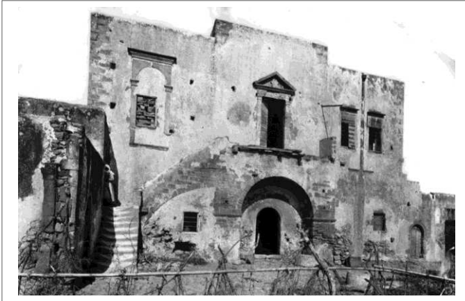
Fig. 2. The eastern façade of the villa in a photograph of 1900-1902 from [11], photographic collection n. 424.

inhabited until the beginning of the 20th century (Fig. 2). It is yet a private property, but two decrees declared it as historical monument in 1965. Thirty years ago, the 28th Ephorate for Byzantine and Post-Byzantine Antiquities carried out an architectural survey, but the current building is very different from that measured (Fig. 3). For this reason, our first aim was to update available information, correcting the existing survey on the field.