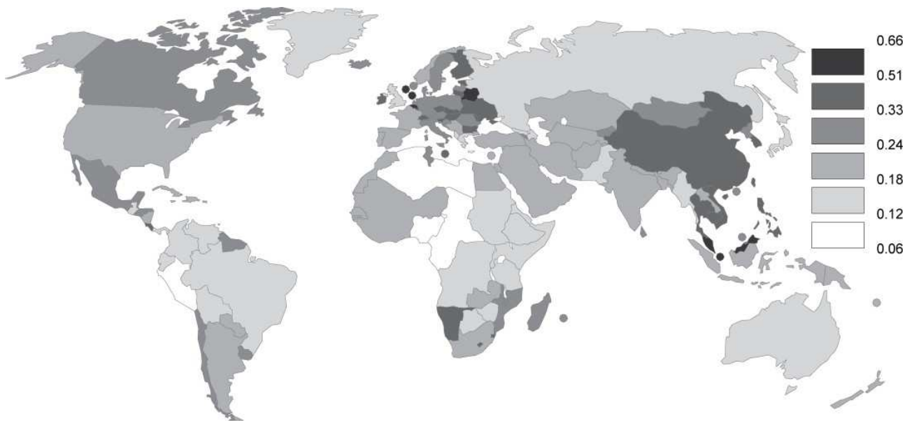
Map 1: Share of vertical trade in total trade - 2 \cdot (VS + VS1^*) / (I + X) , 2004

Made with Phicarto * http://philcarto.free.fr