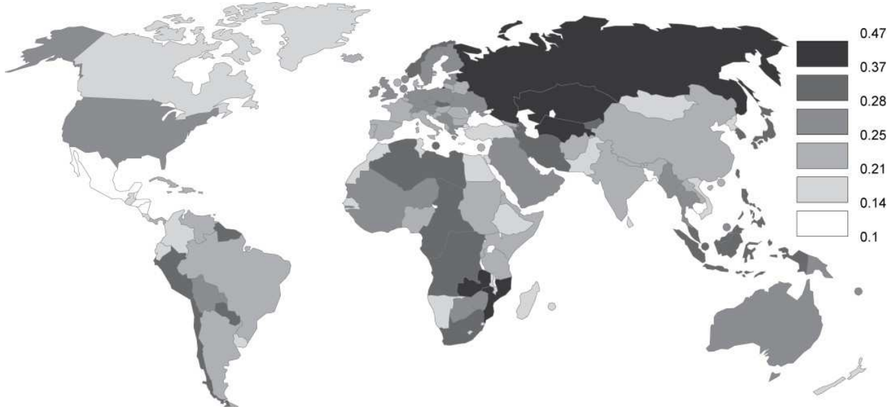
Map 2: Share of exports used as inputs for further exports (VS1/X), 2004

Made with Philcarto * http://philcarto.free.fr