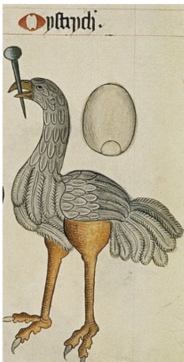
Tudor Pattern Book. ca 1520-1530. Oxford, Bodleian MS. Ashmole 1504, fol. 40 (detail)

But the pilgrim does not say a word about what happened just after this marvellous event. Did the ostrich die? We will never know.