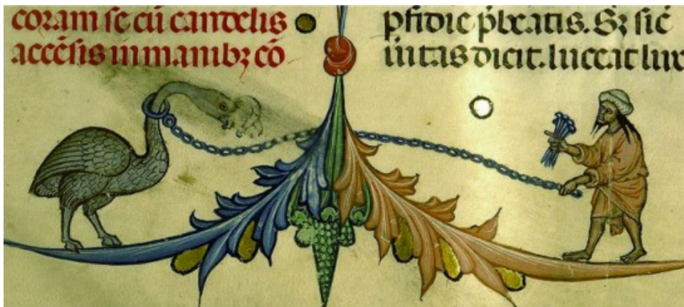
Arabic keeper with ostrich. Guillaume Durand's Pontificalis, ca. 1357. Paris, Bibliothèque Sainte-Geneviève, Ms 143, f. 12.