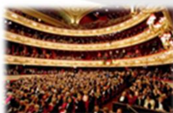
Royal House Opera in London