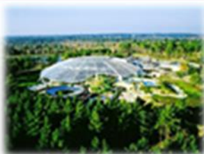
Center Parcs (France)