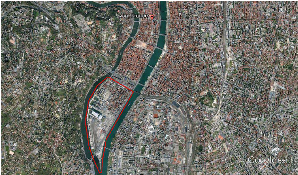
Figure 1 : la « Confluence » area in Lyon (within the red perimeter)

By building several scenarios in terms of urban planning, the target is to understand the mechanisms and impacts of heavy urban projects on goods movements and implementing solutions linked to regulation, land-use and logistics including distribution centers, parking lots.... By applying a systemic view of the subject, this work will also take into account the major constraints of the urban system (Ambrosini and Routhier, 2004). This paper will include the comparison between the present situation of the chosen example (i.e. “La Confluence”) and the scenarios build through the previous steps of this method.