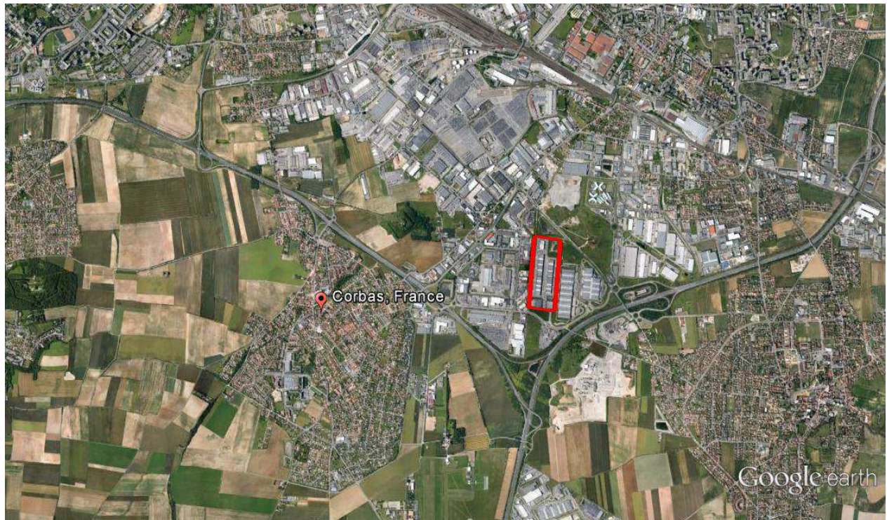
Figure 3 : the new « Marché d'Interêt National » in Corbas

By studying the evolution of the Confluence between 1999 and 2012 we can notice that the economic structure of the Confluence area profoundly changed during this period. As the MIN occupied a large portion of the neighborhood, the implantation of other types of activities was limited to the northern part of the area. Starting from the reorganization of the area the southern part of the Confluence was opened to residential infrastructures and shops (a shopping mall was also opened), thus increasing the global number of establishments (mainly small shops, services and offices) from approximately 990 to 1570 establishments. We can in fact notice that the structure of the area, evolved from a particular form of wholesale area to a regular urban framework. The next figures were produced thanks to the Freturb model and the SIRENE 1 file produced by the INSEE 2 .