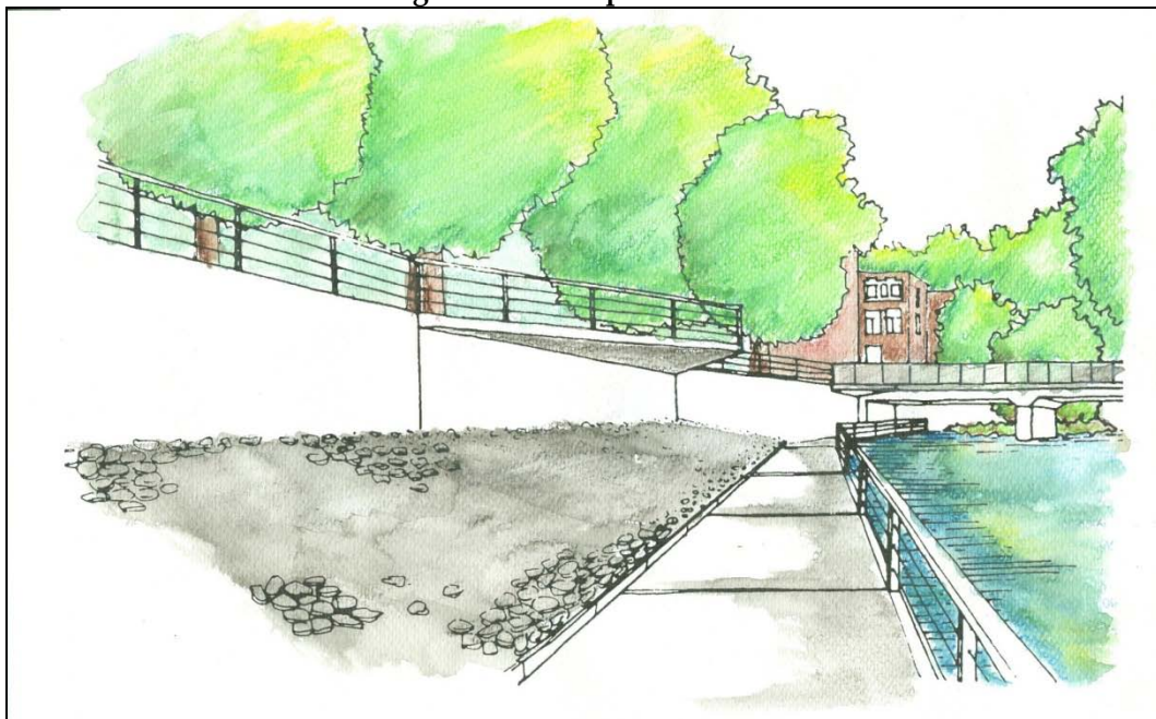
Figure 3: Barren path scenario