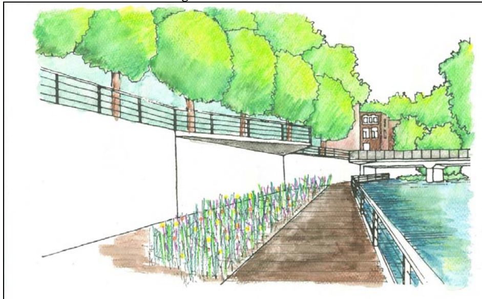
Figure 2: Reference state