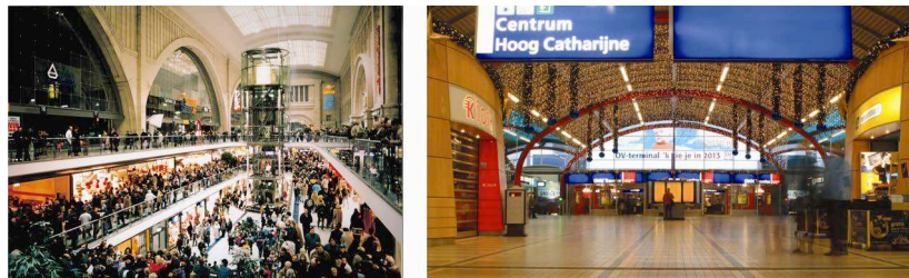
Figure 2. Left: Leipzig Hauptbahnhof. Right: Hoog Catharijne shopping mall and Utrecht railway station

On the contrary, the subway Stalin decided to build in Moscow in the 1930s has a symbolic and figurative programme that eliminates the technical expression in favour of a monumental character that gives these places some exceptional features that are appreciated and sought-after still today.