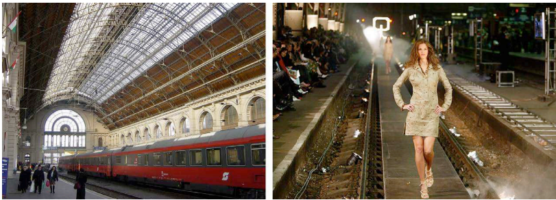
Figure 1. Left: Keleti Station, Budapest. Right: Fashion event in Hlavní nádraží, Praha

Just like tribunals or ministries, long halls and galleries appear, dangling waiting places that later on will be filled. (Colquhoun, 1995)