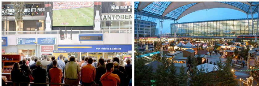
Figure 3. Left: Soccer World Championship at Den Haag Railroad station. Right: Christmas market at Munchen airport

In this sense, for instance, an exemplary revitalisation process involved many German historical stations where, as in Leipzig, Hannover, Karlsruhe, the travellers' building was literally transformed into a shopping centre, to such an extent that the signs of the promoter replaced the name of the station itself. According to the same principle, the stations of Milan and Rome were modified, as well as many other stations in Europe and in the four corners of the world, like Paris and Washington; more radical urban renovation processes see stations and railway parks in the outskirts of the city being placed at the centre of operations in which the cross-over node is conceived as a spectacular commercial node, as it is happening in Switzerland, Netherlands, Japan, and again in Berlin, with the new Hauptbahnhof. (Lambertucci, 2007) In Rome, where the new Tiburtina Station was recently inaugurated – which features a bridge-shaped model intentionally conceived as an urban connection space – one of the designers asked to public to be patient until all shops are opened in order to fully enjoy the expected effect.