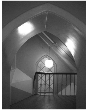
Figure 3. The tunnel with the staircase and the large sand blasted window in the background

The stairs in the building are not just an access road from ground floor to first floor. The largest window in the house is placed by the stairs giving you an experience every time you walk here. It is not the view outside calling for attention, there is nothing to see outside the window except an unpaved backyard and a whitewashed brick wall. The constructing architect did not want people to stop on the stairs to look out of the window and chose to sandblast the panes so you cannot look out and furthermore the light that comes in is soft and nice for a stair walk. When reaching the top of the stairs you get a quite different feeling than you get in the ground floor. On the first floor there are sloping walls, small windows and low ceilings. Compared to the ground floor this is like being in a cave. When walking from the stairs and into the rest of first floor you have to enter a “tunnel” where you have to bow your head when entering. The building makes me pay attention to my body in different ways e.g. by inviting me to turn my body against the light that comes into the house in many different ways and then by forcing me to bow my head to enter the first floor. This makes me aware and responsive to the building and what it does to me.