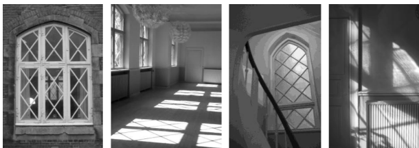
Figure 2. Windows and daylight in the building

Over time I have visited this building many times and it is remarkable that I remember all my visits in the building as like the sun is always shining. Of course it is not, however it is situated in Denmark. An explanation could be, as mentioned above, that the daylight is of such a good quality in the building thanks to the large windows with single layer glass and huge window sills. The large windows are in every room in the ground floor with five of them placed in the main hall leaving the hall light and welcoming.