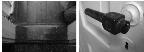
Figure 4. Visible signs of age in the building that gives an extra dimension to the experience of the house

The stairs in the building are not just an access road from ground floor to first floor. The largest window in the house is placed by the stairs giving you an experience every time you walk here. It is not the view outside calling for attention, there is nothing to see outside the window except an unpaved backyard and a whitewashed brick wall. The constructing architect did not want people to stop on the stairs to look out of the window and chose to sandblast the panes so you cannot look out and furthermore the light that comes in is soft and nice for a stair walk. When reaching the top of the stairs you get a quite different feeling than you get in the ground floor. On the first floor there are sloping walls, small windows and low ceilings. Compared to the ground floor this is like being in a cave. When walking from the stairs and into the rest of first floor you have to enter a “tunnel” where you have to bow your head when entering. The building makes me pay attention to my body in different ways e.g. by inviting me to turn my body against the light that comes into the house in many different ways and then by forcing me to bow my head to enter the first floor. This makes me aware and responsive to the building and what it does to me.