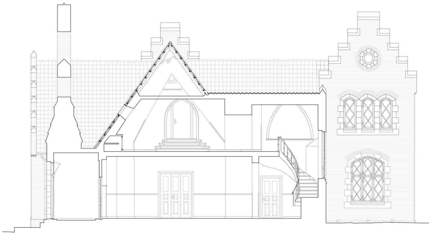
Figure 5. Sectional drawing in the house gives you, together with plans, facades and detail drawings a necessary knowledge about the buildings proportions, structures and designs. Photos and oral descriptions support the drawings and avoid drowning the drawing in information

Traditionally, when documenting objects belonging to the architectural heritage in Denmark, the documentation typically consists of 1) measurement drawings (could be both hand measurements and photogrammetrical computer measurements), 2) photo documentation 3) written descriptions of the building's appearance as objective as possible and 4) archive studies of the building's history from provenance till now. What these methods have in common is that they try to identify and pinpoint the tangible values in the architectural heritage. Drawings, photos and words supplement each other and generally the outcome is a professional high quality product that is very useful and necessary for the future work in the building, like for instance conservation, restoration, transformation or additions in the building. The measurement, here exemplified by a sectional drawing of the house, gives you a lot of the basic information you need to know, when getting to know a building. Proportions, structures, designs and overview are just some of the values captured in a measurement drawing like this.