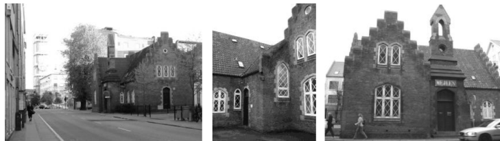
Figure 1. The house seen from different angles.

In a small house in the middle of the city of Aarhus, time seems to stand still. The house is between users and stands empty and rather deserted which is not a representative situation for this house. Since its construction in 1883 the house has been sheltering different types of functions, primarily a child asylum. As it stands in the street today, it looks rather misplaced. None of the buildings next to it are from the same time as this house. They are all younger and taller compared to the small house. The street is narrow and only a few hundred meters from the Town Hall. All day long there is a heavy traffic from buses and taxis in the street that runs only half a meter from the house. Inside the house there is an unnatural silence. You can hear the muted traffic from the outside but there is no sound coming from the house itself. It is empty and turned off. No electricity, no heating, no furniture and no people. Being in this house, feels like entering another time.