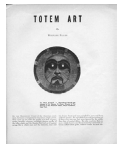
Fig. 7. Wolfgang Paalen, "Totem Art" essay, DYN 4-5 (December 1943).