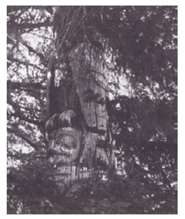
Fig. 11. Eva Sulzer, Haida totem pole in the forest, British Columbia, 1939. © 2008 Eva Friedrich

trees and stayed still, like the figure of a carved raven. Paalen recognized in the bird the Northwest mythical figure of the raven which brings light to the world which he compared to Prometheus, the figure of Greek myth, in "Birth of Fire," another short essay he published in the "Amerindian Number." <sup>52</sup> Paalen's perception grew out of his imagination nourished by his knowledge of Northwest Coast mythology and art. That "totemic moment" is a vital experience in which dream and reality are united.