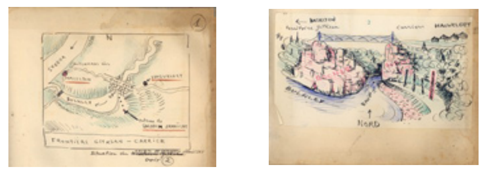
Fig. 4. Kurt, Seligmann Maps , Hagwilget, location of Chieddem Skaniisht pole.

ritually adopted by the clan of the original owner through a symbolic marriage to a deceased woman of this clan.<sup>23</sup>