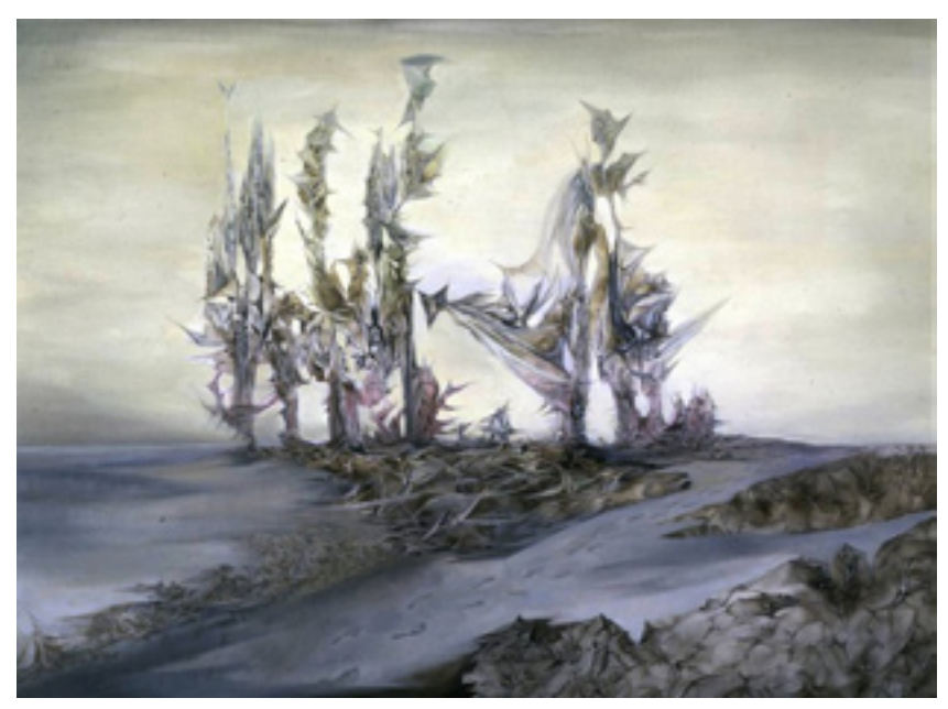
Fig. 9. Wolfgang Paalen, Paysage totémique de mon enfance, oil and fumage on canvas, 1937. © 2008 Gertrud and Harold Parker, Tiburon, CA

His visionary painted landscapes turned out to be the blueprint of the scenery of British Columbia and Alaska, as described in "Voyage Nord-Ouest" (only recently published) and "Paysage totémique" which appeared in fragments in four issues of DYN .<sup>45</sup> Regler writes that Paalen "[...] was no less surprised when he found with what certainty he had felt the light and atmosphere of the country around Sitka in his "Fata Alaska [painting]," before actually seeing it."<sup>46</sup> The landscape he discovers on his journey shapes up as the literal transposition of his preconceived vision. In "Voyage Nord-Ouest," he remarks: