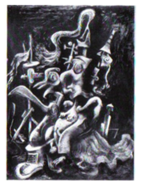
Fig. 1. Kurt Seligmann, Totems I , 1938, india ink with feather brush and color on glass. Dimensions unknown. © 2008 Artists Rights Society