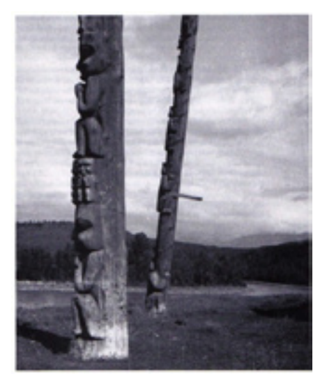
Fig. 5. Kurt Seligmann, Kispiox totem pole, published in Minotaure 12-13 (May 1939).

not record any specific intercourse with natives. It may well be that villages were deserted as people had gathered along the coast to work in canneries. In any case, it is my contention that Paalen was more interested in the Northwest culture as an object of study rather than with living people in a poor economic predicament. His reflection on Northwest Coast culture draws on written documentation as well as on objects rather than on fieldwork observations. As a fervent collector, Paalen is more concerned with scouring every curio shop he happens to discover, and hunting for artifacts rather than with recording myths and talking to people. As a matter of fact, Paalen's "diary" is full of notations about his latest acquisitions: