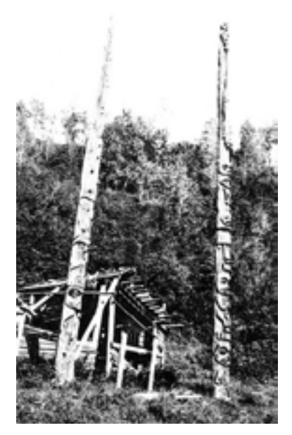
Fig. 8. Kurt Seligmann, Kaiget totem pole, Gédem Skanish [on the right] , British Columbia, 1938.

Seligmann and his wife took many field photographs that convey a feeling of sadness – ruins in deserted places with no living soul around; the photographs illustrating his 1939 article show the Kaiget pole standing at the edge of a ravine in an empty village with run-down buildings and collapsing roofs. A picture of Kitwancool renders the same atmosphere: memorial poles, some still standing, several tottering or fallen, in an abandoned village with dilapidated houses. This atmosphere is even more striking in the photograph that shows two isolated poles by a river-bank, as symbols of a long-gone splendor. Seligmann's photographs have a scientific value as they record the Gitksan-Wetsuwet'en poles' condition at a certain period of time, but through photographic documentation the photographer intentionally brings out his idea of a dying culture.