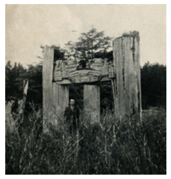
Fig. 10. Eva Sulzer, Wolfgang Paalen at a shaman's grave, Masset, B.C., 1939.

Profiles of people and beasts inextricably intertwined, all dimmed in the evening light, issued from innumerable hatchet blows as precise as a wolf's incisors sinking into its victim, the totem poles stand tall, as if they were lances from a gigantic battle painted by Ucello [...].