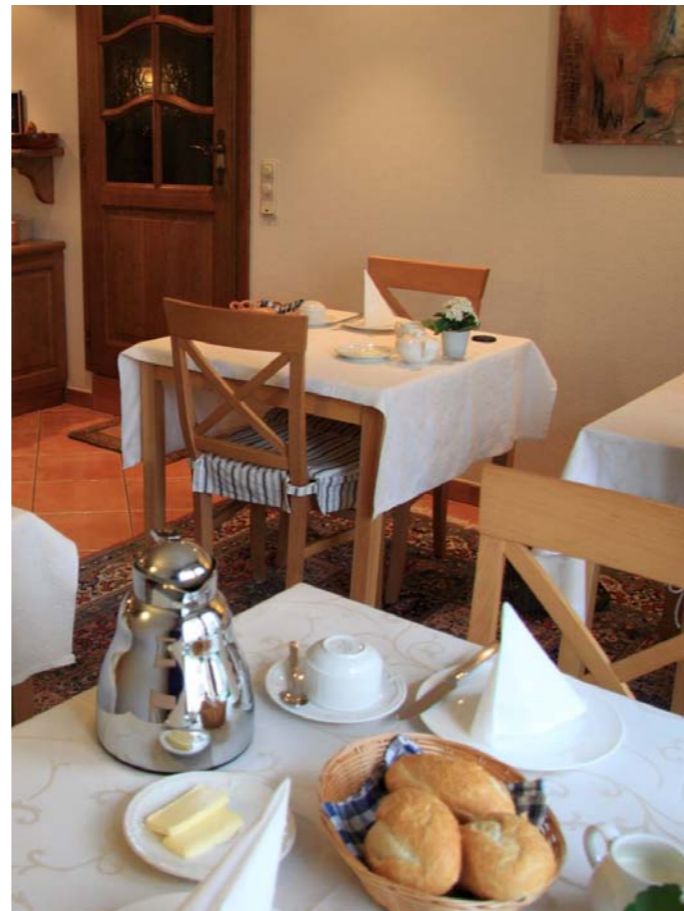
Liège - ENTI 2011