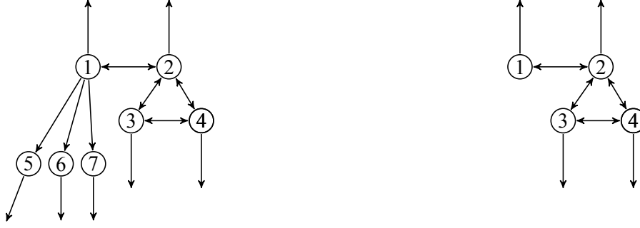
Figure 2: Index versus cumulated shares

be distinguished from that of a decrease: An increase has no impact on payments because i already repays its debt: \frac{\partial V}{\partial z_i^+} = 0 , whereas a decrease triggers i 's default; thus the left derivative \frac{\partial V}{\partial z_i^-} is at least equal to 1. (Using the same argument as above, it can be computed by taking for D the set of institutions that are defaulting or at the boundary.) This explains why the value function V is not differentiable. 21