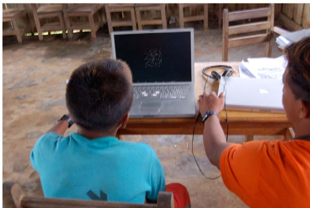
Figure 1. Experimental set-up. Mundurucu observers viewed stimuli that were presented on a solar-powered laptop computer. Most observers came from the isolated village of Muissu, located south of Jacareacanga along Rio Cururu, in the Para region of Amazonia. Photo taken in Muissu, copyright Pierre Pica/CNRS. doi:10.1371/journal.pone.0028391.g001

In separate experiments, data was collected (by SJ) from 36 American volunteers (mean age 24, range 18–46 years, 21 males) tested at the Department of Psychology, Vanderbilt University. Informed written consent was obtained from all American