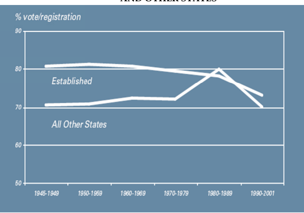
Figure 2 – DIFFERENCES BETWEEN ESTABLISHED DEMOCRACIES AND OTHER STATES