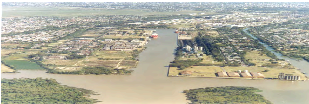
Image 3. La Plata Port. View from Río de La Plata river towards the Cuatro Bocas channel (center of the image) and Petrochemical pole (Repsol YPF distillery). On the right, city of Ensenada, on the left, city of Berisso.

As a result of this, it has been proposed to study the socio-economic feasibility of taking the Barrio Campamento neighborhood (5 blocks) and incorporating this zone into the area of port operating procedures as one of the work hypothesis in the Master Plan and Port Zoning. One of the proposals revolved around the Refunctionalization and relocation of 5 blocks, over a total of 9 blocks that the neighborhood currently has, there will be 4 left.