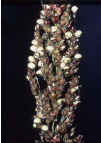
Photo 1. Damage: aborted panicle after sorghum midge infestation (G. Trouche, CIRAD)