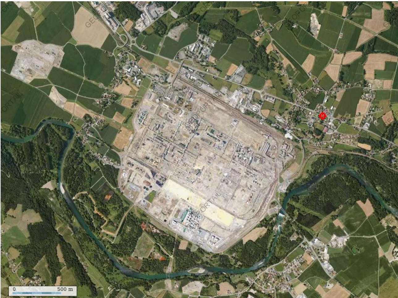
Illustration 1: Aerial view of the Lacq natural gas processing plant. Empty lots show the decline in industrial activity. Industrial risk and harmful effects do not prevent people from living close to the site (red dot).