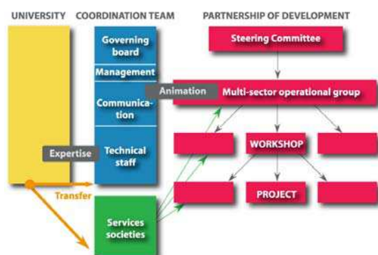
Diagram 3: CATALYSE territorial governance

Catalyse also offers a participative governance of the sustainable development partnerships.