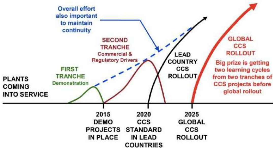
Figure 2: Method of delivering CCS throughout the world with responsibility initially placed on developed nations

R&D sector) when deciding on how to allocate funds. Gibbins and Chalmers (2008) argue that CCS should follow a number of tranches before being rolled out globally. As shown in Figure 2, expertise may be exported to developing nations. For instance, the UK is fostering links with China – which is currently installing massive generating capacities of coal-fired power stations – to share expertise in CCS.