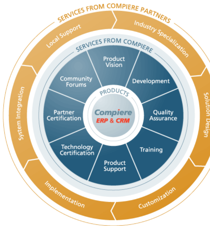
Figure 1: The Compiere “ecosystem”

3) Architects. : As Horn (2004) points out, assembling components requires access to the source codes (problem of compatibility), and their adaptation to different needs (of users and other components). They must be available in the form of open-source software (therefore legally modifiable). The competitive advantage in using FLOSS, in addition to price, is therefore the ability to offer an assembled set of components with greater interoperability, which should increase the quality of the final product, on a market where the quality of services is one of the recurrent problems (see De Bandt, 1995). Revenues are generated by assembling and adaptation services, as is the case for any traditional service company. The only uncertainty about the model concerns the availability of the components: who will develop them and who will maintain them? Moreover, the customers of these companies may already have (proprietary) programs installed that need to be taken into account. In the end, an open source strategy could even be a guarantee of means (maximum use of free software), but not a guarantee of the results (use of only free software), unless the customer requests this, since in this situation, s/he has the last word.