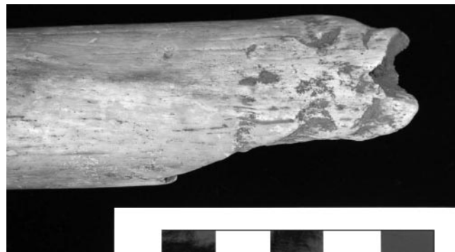
Fig. 3. Details of the carnivore toothmarks on the distal end of the RdV 1 human femur diaphysis.

Homo femora in general (16–21), have largely subcircular mid-shaft subperiosteal contours, variable development of a medial buttress, a variably prominent linea aspera , and no evidence of a pilaster. In addition, it is sometimes difficult to distinguish both lips of the linea aspera on Neandertal femora, because they are united in a single relief forming a soft crest. Although some Late Pleistocene modern human femora approach this cross-sectional morphology (22, 23), they usually have tear-drop shaped cross-sections, prominent pilasters, and flat or especially concave surfaces adjacent to the linea aspera . The RdV 1 femur exhibits most of the archaic Homo femoral diaphyseal features and contrasts with the femora of early modern humans; its midshaft cross-section is almost round with a continuously convex contour; there is little projection of the linea aspera , no flattening adjacent to the linea aspera , and, hence, no pilaster. Even though one could find a gracile recent human femur with a similarly