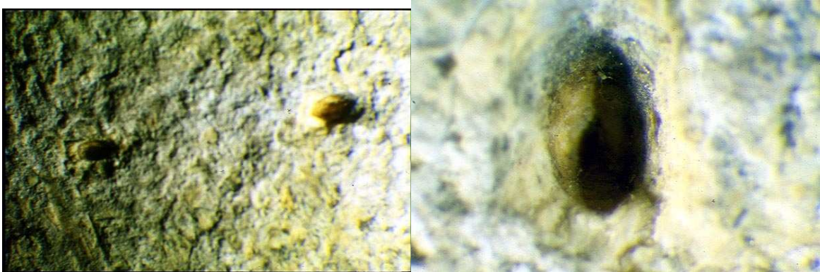
Figure 5 Holes at the greater magnification ( A. Dambricourt Malassé)

holes apparently denote postero-lateral movements, thrice rapidly repeated, not sufficiently deviating from the symmetry plan. These movements imply those necessary for parietal deviation, the gesture which needs the use of both forearms.