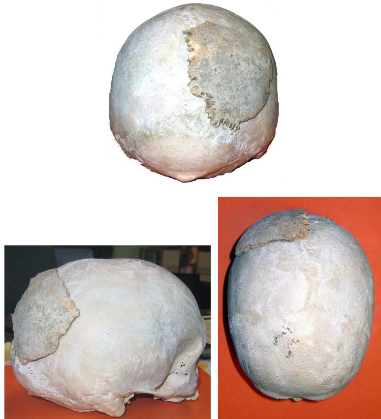
Figure 3. The parietal of Bolgrad projected on the modern skull, viewed from behind (with the lambdoid and sagittal sutures); the lateral view, and viewed from above (A. Dambricourt Malassé).

The endocranial surface was covered with a thin carbonate crust with no other apparent taphonomy-related changes.