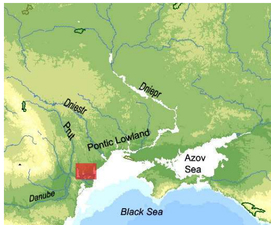
Figure 1: Investigation area.

a deep ravine, at the altitude of 40 m, close to the abrasion cliff (Fig. 2). The excavated area reached 700 sq. m. Altogether, the remains of eight dwellings have been identified (six semi-subterranean huts and two surface houses). The semi-subterranean dwelling No 1 was comparatively well preserved. It formed a large trough-like hollow 7 by 6 m; which floor was found at the depth of 1.6-1.8 below the present-day surface. A circular hearth 1.5 m in diameter was found in the protruding northern part of the dwelling. Another hearth, filled in with potsherds and animal bones, was established in the central part of the dwelling; it formed a cylindrical hole widening at the bottom and reaching a diameter of 0.8 m. The lower part of its filling consisted of cemented ash covered with the layer of mud-bricks, 20 cm thick.