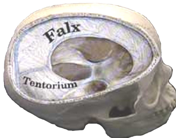
Figure 7. Falx cerebri and tentorium cerebelli viewed from inside the skull

The exocranial surface of the vault forms the basis of dura mater in three forms: one recovering the lobes, particularly the parietal and occipital ones, and the falx cerebri; then the sagittal and median which correspond to the doubling of the dura mater (both the right and left), and the tentorium cerebelli which forms the connection between the dura mater of the two occipital lobes with that of cerebellum (Fig.7).