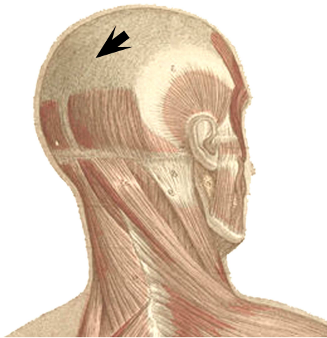
Figure 6: Location of the holes and traces of scraping on the skull.

The exocranial surface of the vault forms the basis of dura mater in three forms: one recovering the lobes, particularly the parietal and occipital ones, and the falx cerebri; then the sagittal and median which correspond to the doubling of the dura mater (both the right and left), and the tentorium cerebelli which forms the connection between the dura mater of the two occipital lobes with that of cerebellum (Fig.7).