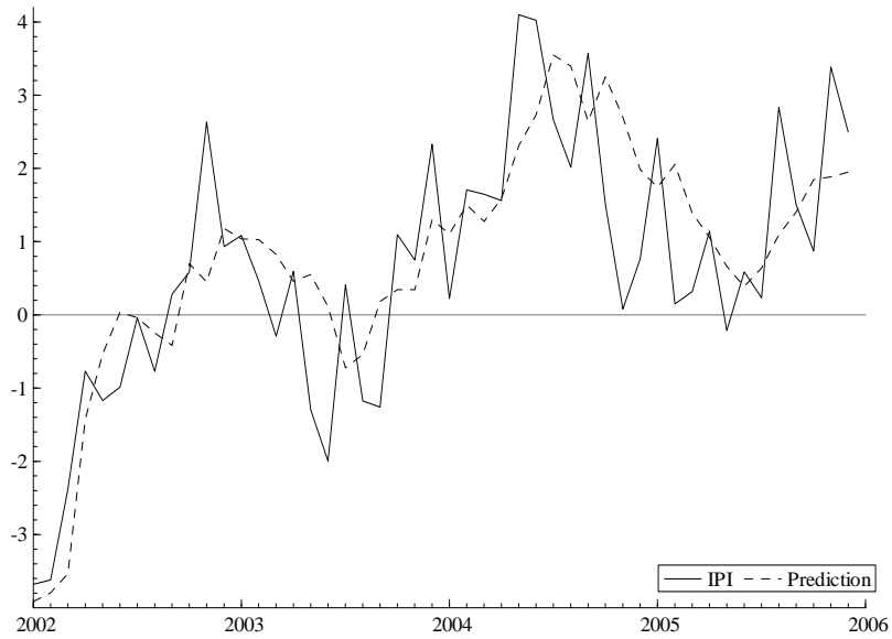
Figure 2. Bootstrapped confidence interval at the 0.70 confidence level (2002-2005)