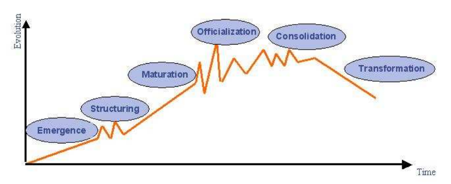
Figure 3: Lifecylce of communities [Boughzala, 2005]

The structure of a community (rules, roles and processes) and the implication of the different types of actors are different from a phase to another.