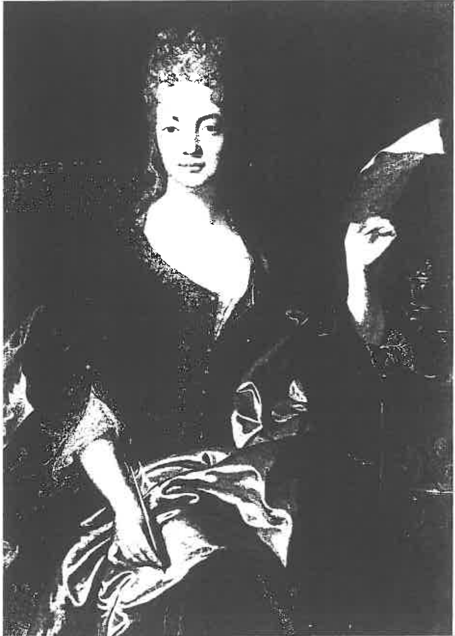
Fig. 3 François de Troy (1645-1654), Madame Jacquet de La Guerre , c. 1695, oil on canvas, London, private coll.