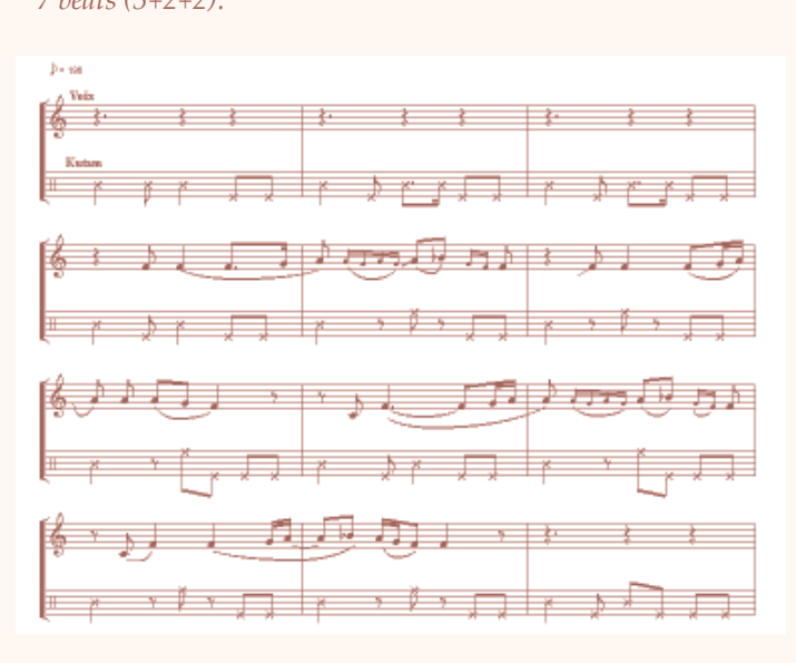
Fig. 1a: Padmavati's version. Tune 1 combined with a cycle of 7 beats (3+2+2).

CHRISTINE GUILLEBAUD, Laboratoire d'Ethnomusicologie, Paris X, Nanterre