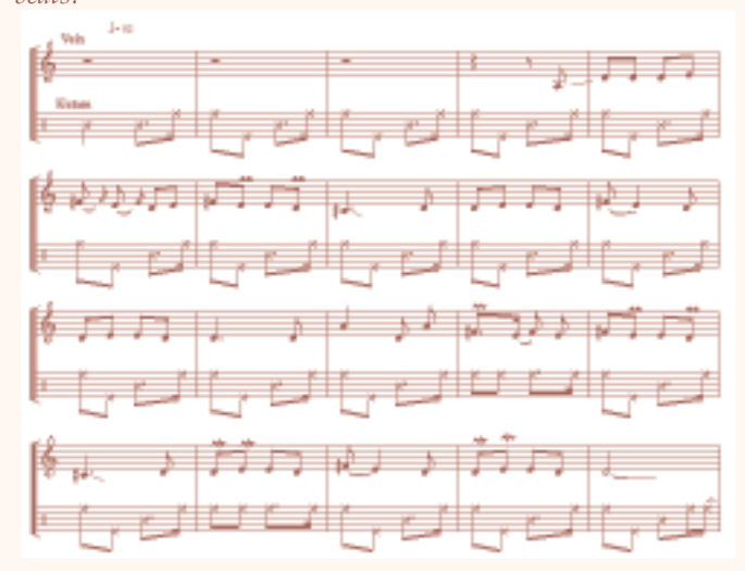
Fig.1b: Janaki's version. Tune 2 combined with a cycle of 2 beats.