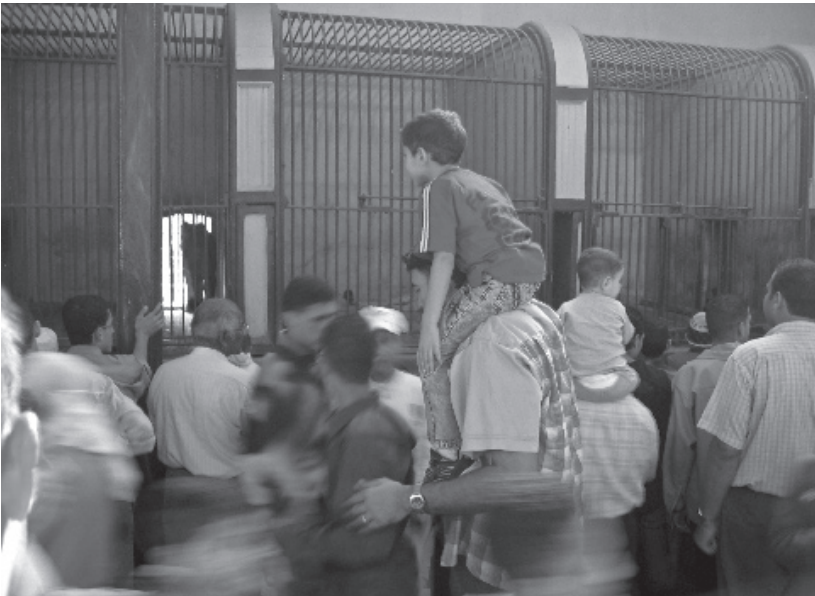
Visitors to the zoo view the caged animals.

The zoo is usually a family destination. But during these few intense days, groups of youth and young couples swamp the families. However, families do not cede any territory; they bring their children with them, well dressed in their 'Id gifts, little suits for the boys and little white dresses for the girls—or wearing a complete wardrobe sold under plastic in stores, with flowered hat included. In all cases, parents have taken great care to make sure that children appear in their finest attire, costumed as angelically and child-like as possible; whereas the adolescents proudly display their brand-name 'Id gift outfits (Nike, Levi's, Adidas, etc., almost always counterfeit) and the indispensable accessories of the season. One can guess that parents, without being in their 'Sunday best,' have made a vestimentary effort as well. For men, pants and shirt are preferred. The gallabiya (long shirt-like garment that reaches the floor) would be gauche. Women wear dresses carefully matched with their headscarves. Women of popular quarters are identified by the way they wear their scarf knotted at the neck rather than under the chin. The appearance remains a strong marker of greater or lesser social ascension. The families circulate among the animal cages, following the children's vague desires to see the animals or to consume—ice cream, another cola, tiger or lion makeup, or an inflatable balloon in the shape of a deer or a giraffe.