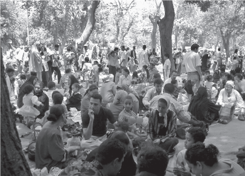
The crowds at the zoo during holidays.

about wandering in groups, invading the entire space given over to people, lingering; then suddenly agitated by a brusque change of regime, they run toward the larger crowd increasing its size. The object of these mobs is a fight breaking out, rather than an animal making a show, followed by nothing at all, a nonevent that fed upon the random attention of groups of visitors. The happy groups flow, occupying physical space to its smallest corners, attempting to penetrate the grottos, or spilling onto the forbidden lawns.