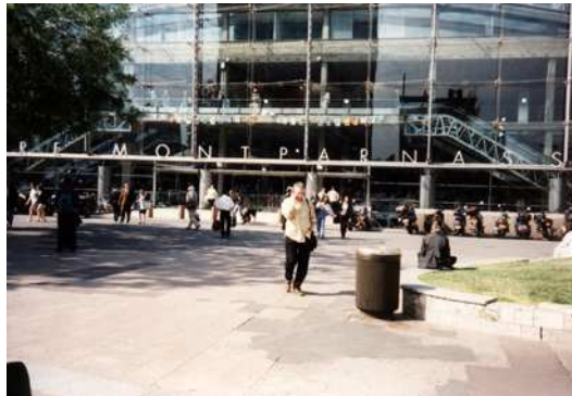
Entrée Gare Montparnasse – Place Raoul Dautry

First, from an architectural point of view, Paris - Gare Montaprnasse is a very interesting space. Modern architecture has been employed to connect different levels of circulation : at level -1, the underground one, pedestrians come out from the subway. They can climb to level 0 and go out from the building to take a bus in the street for example.