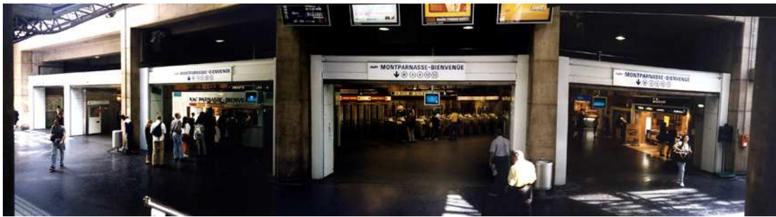
Gare Montparnasse – Underground level / entry-exit of subway