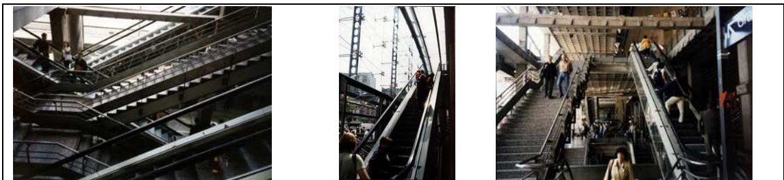
ordinary and escalators between levels

They can also continue to climb to level +2 to take a train to any big cities in France or in Europe. They can also go to level +1 and take a train for the suburbs – they have to climb again one level to use the platform. All these levels in concrete are connected with each other by stairs (ordinary and escalators ones).