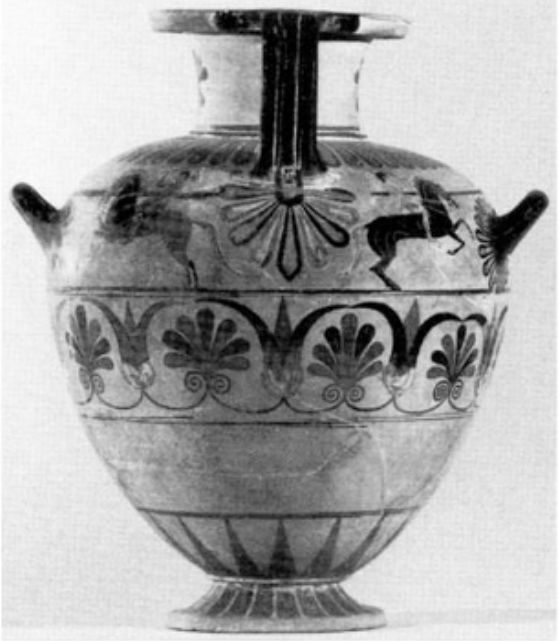
Fig. 06: Black-figure hydria. Discovered and produced in Cerveteri. Dimensions: 42,8 cm high, max. 38,5 cm large. Dated from 540-530 BCE. Kept in London, British Museum (inv. B 59). After Bonaudo 2004, cat. 1.

While dance iconography is regularly characterized by dancers that show flexed legs, a funerary base kept in Perugia (inv. 529),<sup>21</sup> shows human figures that have, on the contrary, their legs apart but straight. They seem to be engaged in walking. However, the turning position of several figures, as well as the gestures, invite to identify the representation as a dance scene.