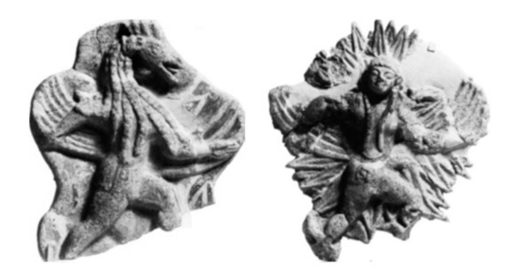
Fig. 01: Antefixes from Pyrgi. Dated from ca. 510 BCE. Kept in Santa Severa, Antiquarium of Pyrgi. After Massa-Pairault 1996: 117.