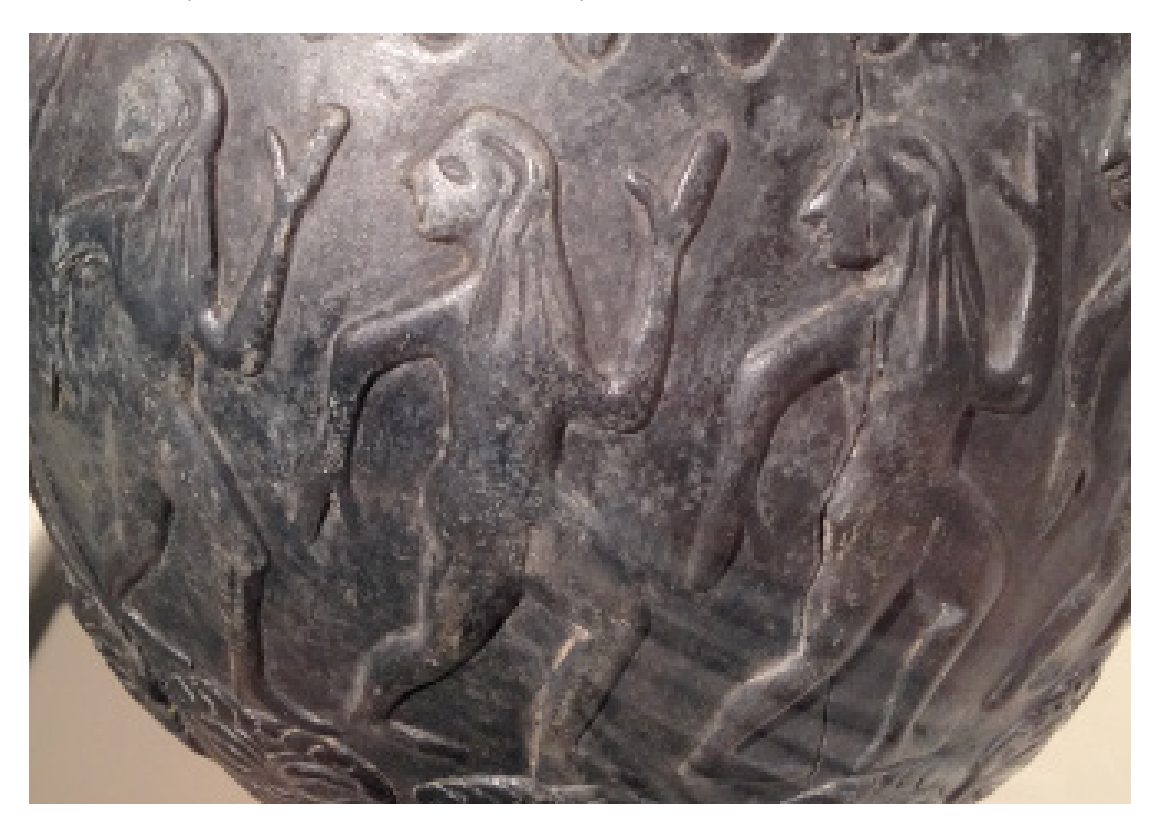
Fig. 04: Œnochoe in bucchero pesante . Produced in the area of Chiusi. Dated from 6th cent. BCE. Kept in Milan, Museo archeologico (inv. A 0.9.296).

In some scenes of running competition, the body of some runners turns. When it does, the head is positioned in an opposite direction to that of the legs. The aim of this visual several is to highlight the competitive nature of the scene. Indeed, the fact that athletes turn their head backward could be interpreted as a way to control the distance at which their opponents are. This specific aspect invites to resume the identification of some visual representations. On a series of oenochoe in bucchero distributed between the museums of Milan, Tarquinia, Chicago and Edinburgh (fig. 04), the depicted scenes on the main body of the objects are composed of naked male figures engaged in the same posture. And, they follow each other. The legs, flexed and in profile, are engaged in a walking action. The feet are on the tip. The arms are raised and arranged asymmetrically on either side of the figures. The repetition of those figures could lead to identify a running scene. However, the turn showed on all the bodies invites to consider it as a dance scene. In running scenes, not all athletes turn their head backward. Moreover, the muscular tension leads to represent the hands strictly in alignment with the forearms while in dance scenes the hands regularly shift. If a hand possibly presents a shift in sports scenes, it will be the one placed frontward, and it will put the accent on the runner's direction.