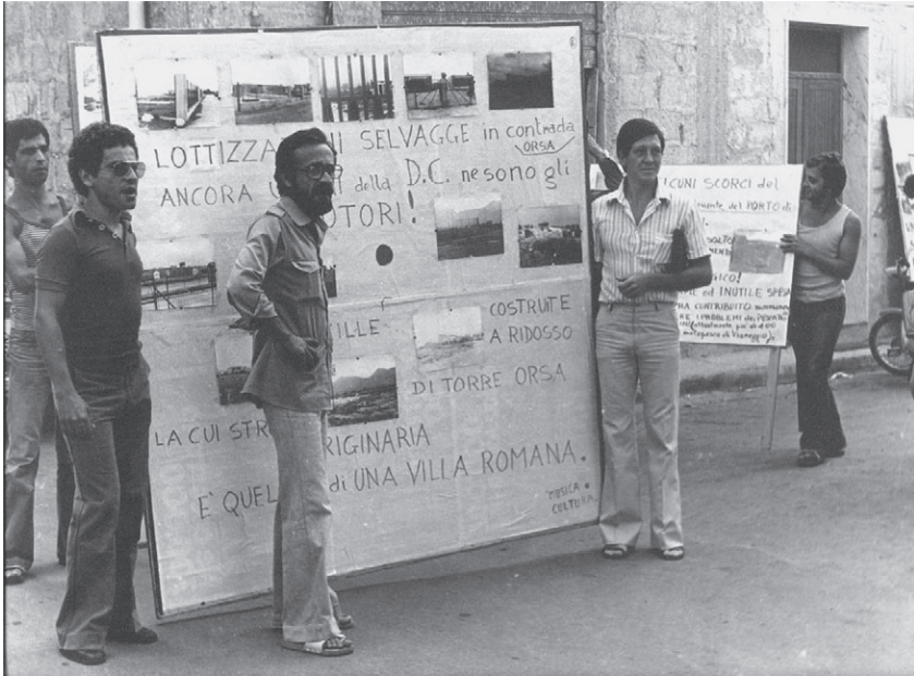
Figure 1: Exhibition “Mafia & territory,” 1978: Impastato, center. (Source: Photo Archive, Centro Siciliano di Documentazione Giuseppe Impastato. Photographs displayed on the poster by Letizia Battaglia.)

From the late 1970s the two photographers began to display their work across Sicily as part of travelling exhibitions. In 1978, shortly before his murder, an extreme leftwing leader organized an exhibition called Mafia e territorio (Mafia and territory). The photographs exposed, accompanied by descriptions written in capital letters, the wide range of damages that had been caused to the environment by the collusion between mafiosi and the local political authorities in the little town of Cinisi near Palermo (see Figure 1). The murder of the exhibition organizer, anti-mafia activist Giuseppe Impastato, on May 9, 1978, only a few days after its opening, did not deter the organizing of other anti-mafia exhibitions with photos on poverty, environmental degradation, violence, social inequality, squalor, neighborhoods in ruin, and killings. One of the most famous of these exhibitions, called Mafia Oggi (Mafia today), opened on May 9, 1979, just one year after Impastato’s murder (Figure 2). It was organized by the Centro Siciliano di Documentazione, 3 with