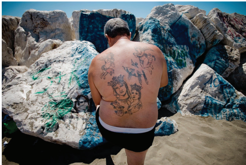
Figure 7: Tattoos on skin and rocks.

Mauro D'Agati, published in Napule Shot (D'Agati 2010), on his experience sharing everyday life with a Camorra group. The artist did not conceive of his work as a political act or civic duty. 7 He photographed the Camorra from the inside , taking pictures of its members engaging in daily activities: eating, playing games, performing music, holding festivals, manufacturing cocaine, marrying, engaging in street skirmishes with the police, being arrested. Environmental degradation is still there as the backdrop. But the aesthetic code has changed. It is not the black and white of the Zecchin and Battaglia images anymore, but the use of bright colors, showing happy and relaxed faces and people in nonchalant poses: men wearing witches' masks and preparing cocaine (Figure 5), boys playing football or handling a weapon (Figure 6). The dramatic tension is gone. The images show that the Camorristi do not want to hide but to showcase themselves, as when they expose their tattooed bodies to the sun, blending in with the stones that are covered with graffiti (Figure 7). Their lives are not concealed but openly displayed. The images show a mafia that is integrated into its environment, where there is no stigma attached to it, where it is not seen as a plague. Being illegal is presented as an ordinary way of living. The images suggest that