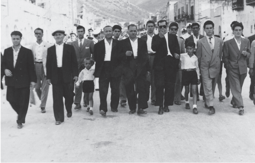
Figure 9: Young Peppino Impastato (front row, third from right) holding the arm of his father (a mafioso), walking alongside one of Baladamenti's brothers.

fact that members of a mafiosi family made recourse to the state's justice system could be considered as a historic transgression of the omertà code, the central element of its mental and cultural universe. According to folklorist Pitrè ([1889] 1944: 295), omertà commands one not to denounce the violence one has suffered to representatives of the law. The fact that members of Impastato's family did so thus can be seen as a sign of change in attitude not only toward the mafia but also toward the state.