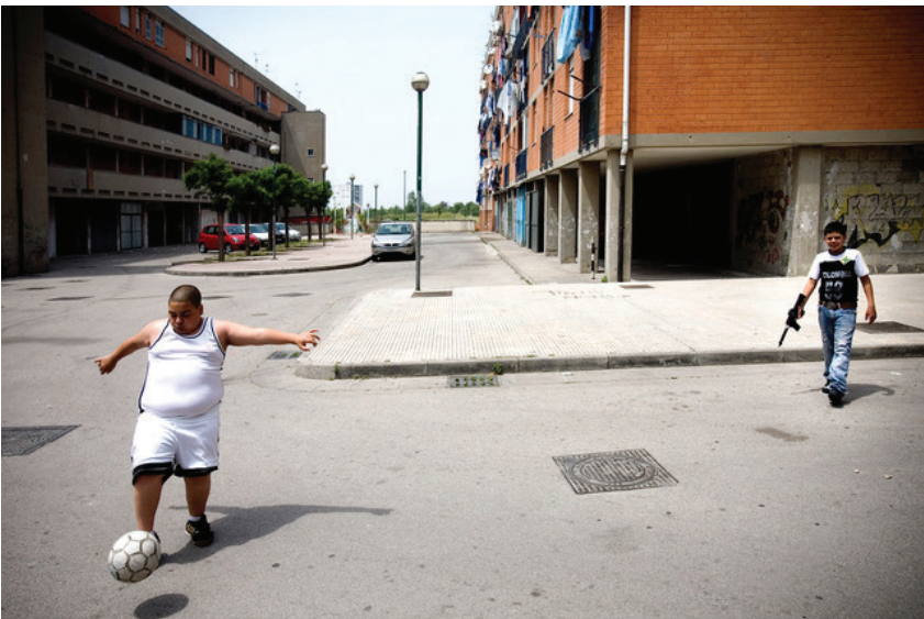
Figure 6: Kids, one of them holding a weapon, play games in a rundown neighborhood of Naples.