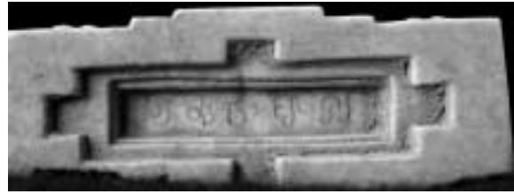
Fig. 2 Lower surface of the pedestal below the image illustrated in Fig. 21

A fairly large number of these images bear inscriptions distributed in the lower part, i.e. on the front or/and sides of the pedestal (Fig. 14b), on the lower surface of the sculpture, or on the back (Figs. 2-3, 5b). While the work of deciphering these inscriptions is still in progress, one cannot exclude the possibility that some reproduce yantras similar to those integrated in Buddha images of