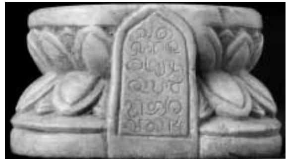
Fig. 3 Rear side of the lotus pedestal seen below the image of Fig. 15